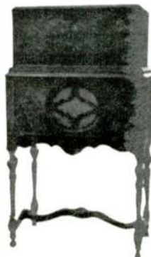
GRIGSBY-GRUNOW MAJESTIC 1928 8 TUBES AC $138.00