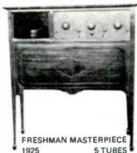
FRESHMAN MASTERPIECE 1925 5 TUBES