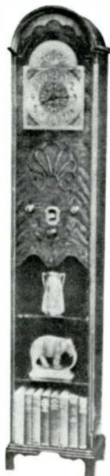
COLONIAL 1931 CLOCK CABINET