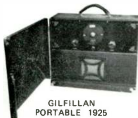
GILFILLAN PORTABLE 1925