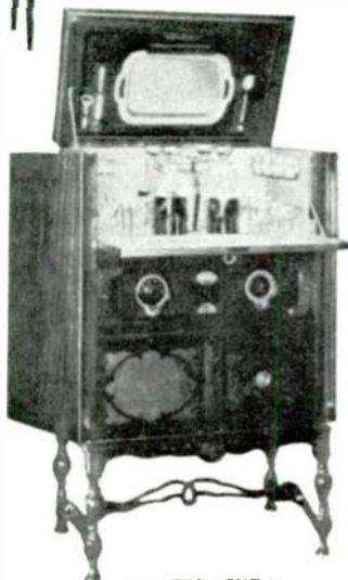
ATWATER KENT 44 POOLEY RADIO-CELLARETTE 1928 8 TUBES AC $536.00