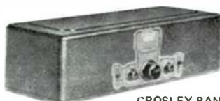
CROSLEY BANDBOX 1927 METAL TABLE