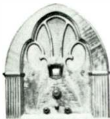
PHILCO 90 1931 CATHEDRAL COMPACT