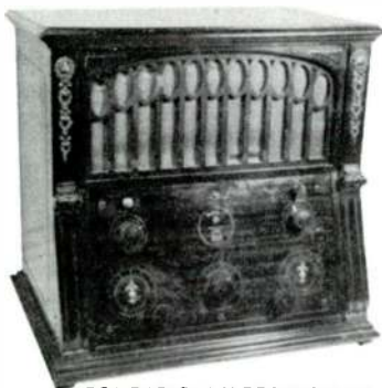
RCA RADIOLA X REGENOFLEX 1924 CONSOLE TABLE