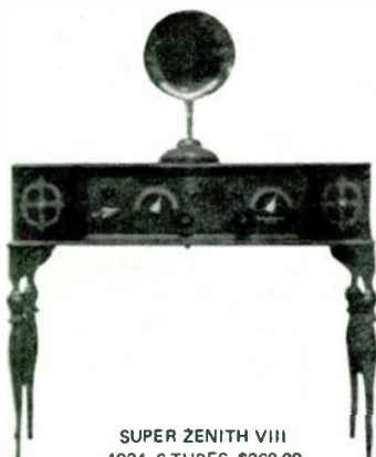
SUPER ZENITH VIII 1924 6 TUBES $260.00