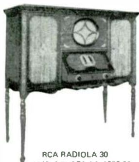
RCA RADIOLA 30 1927 8 TUBES AC $575.00