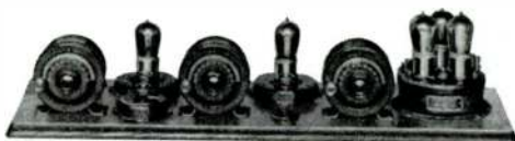
ATWATER KENT 10B 1924 BREADBOARD