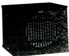
AUTOMATIC RADIO SR. 1930 AUTO