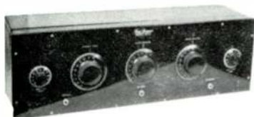
FREED-EISEMANN NR-5 1925 TABLE