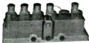
NATIONAL MB-32 1931 CHASSIS