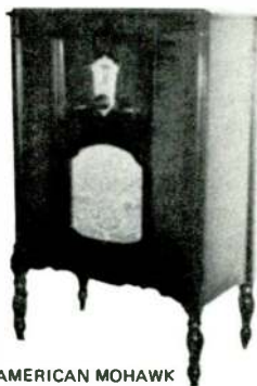
ALL-AMERICAN MOHAWK LYRIC 1929 10 TUBES AC $169.00