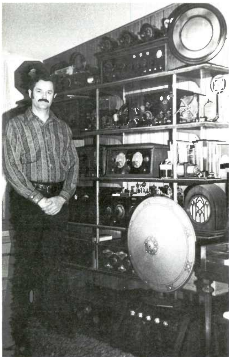
THE AUTHOR AND SOME COLLECTIBLES