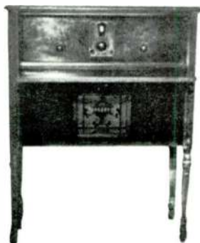
PHILCO 86 NEUTRODYNE PLUS 1929 8 TUBES AC $275.00