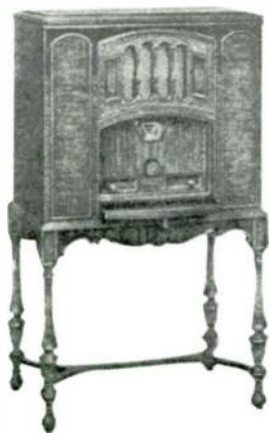
STROMBERG-CARLSON 638 1929 8 TUBES AC $380.00