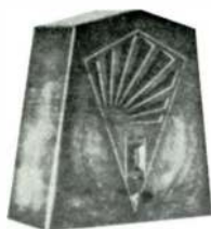
KELLER-FULLER RADIETTE 1930 MANTEL COMPACT