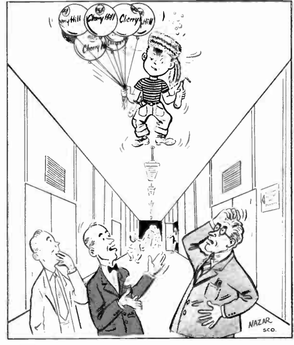
"He says the Open House was a lot of fun . . . but he's fresh out of cookies . . . tired of floating around hallways . . . and wants to go home!"