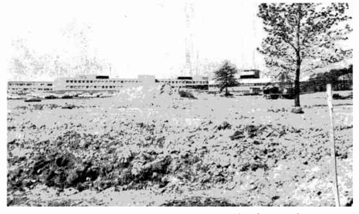
In May it was still just a diamond in the rough (Below) finishing touches readied it for games starting in June