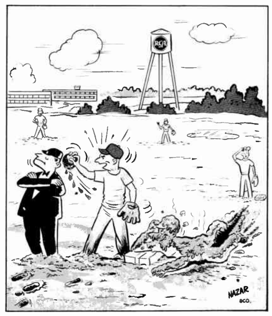
"I'm sorry—but under Rule 32—Section 5, it is within my authority to state it was not a <u>clean</u> tag . . . and I say the ball never touched the runner!"