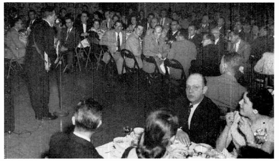
The Radio-"Victrola" Division was entertained at Tavistock Country Club