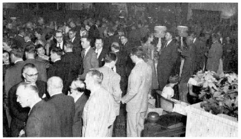
Service Co. started their festive affair with a recepton at CH Inn