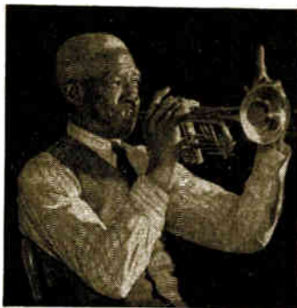
JOHNSON He put New Orleans on wax