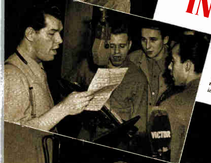
Tex Beneke and three of the four "Crew Chiefs" as they rehearse a number prior to calling for a "take."