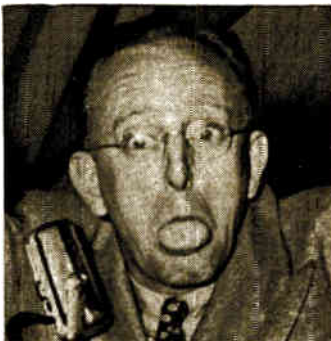
KAY KYSER—An act for the press

In a recent number of Seventeen , mag for teen-agers, Kay Kyser was featured in an article called "Minors Major with Kyser."