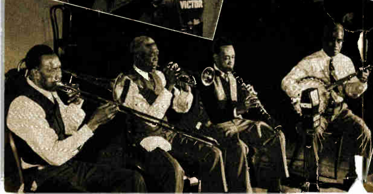
A part of the Bunk Johnson band as they record for RCA Victor. Left to right: Jim Robinson, Bunk Johnson, George Lewis and Lawrence Marrero.