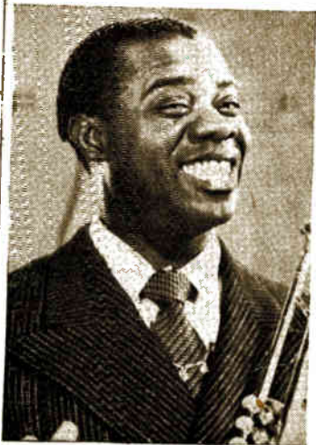
LOUIS ARMSTRONG Back with the Blues

With no "blues" discs out of Louis Armstrong during the past five years, his recent signing of an exclusive recording contract with RCA Victor is looked upon as a real event by blues enthusiasts the country over.