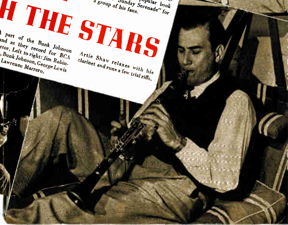
Artie Shaw relaxes with his clarinet and runs a few trial riffs.