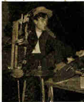
SPIKE JONES—A circus

After two years of turning a deaf ear to booking agents and fans alike, Harry James has finally agreed to tour the country in a series of one night stands. The personal appearances will begin immediately following James' current Meadowbrook (LA) engagement.