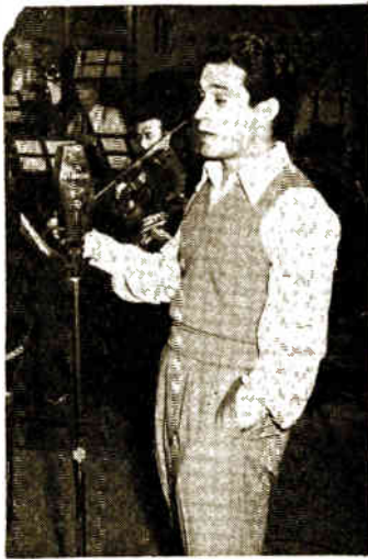
PERRY COMO—A fan "good"