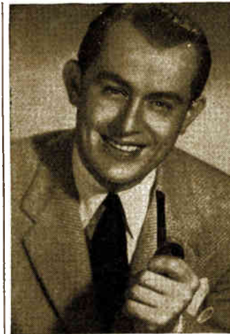
VAUGHN MONROE—"I lost a hat.."

In fact, to please everyone, at the opposite end of the pole we occasionally delve into opera with Vesti la Guibba from I PAGLI-ACCI which again seems to fill the bill with both teen age and mature audiences. You see, before I entered the popular music business I studied opera. I might be doing concert singing today except that I had to eat. Maybe if I were an opera singer I wouldn't be having my hat snatched and my tie torn both ways with my throat acting as referee, but I'm sure it