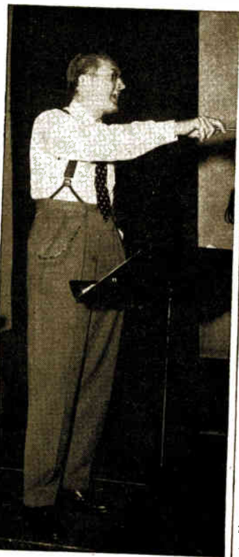
TOMMY DORSEY From WOR, a directorship

Besides handling the Sunday night stint, Dorsey has also been appointed popular music director for WOR, N. Y. C., it was announced by that station some time ago. In addition to working with the program director, the "solid man" will also supervise on WOR and the Mutual Network his own show called, "Endorsed by Dorsey." Add to this a list of personal appearances, RCA VICTOR Recording Sessions and dance dates and you have a pretty full schedule for Mr. Dorsey for the summer months.