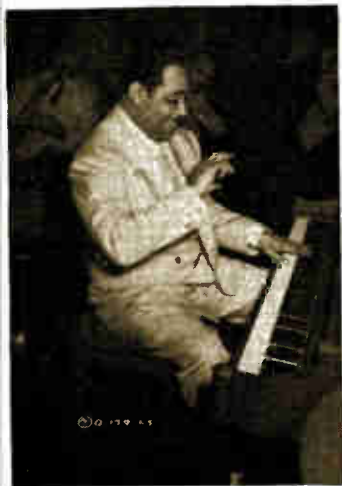
DUKE ELLINGTON—Europe beckons

For years the name of Ellington has signified to the peoples of Europe the best in American music. They have heard him on RCA VICTOR records and via short wave radio, now they want to see him and his fine band in person again. In answer to the beckoning hand of Europe Ellington is planning an extensive Continental tour, come 1947.