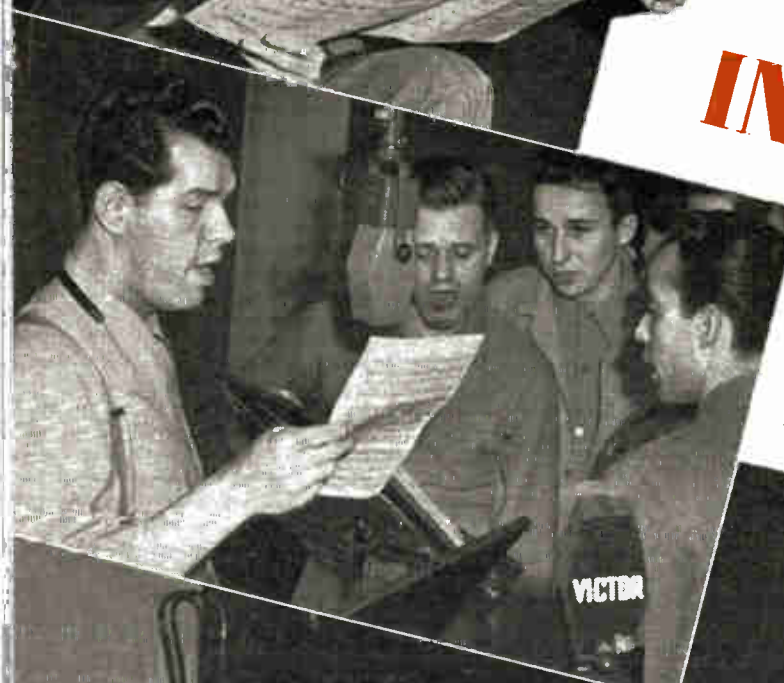
Tex Beneke and three of the four "Crew Chiefs" as they rehearse a number prior to calling for a "take."