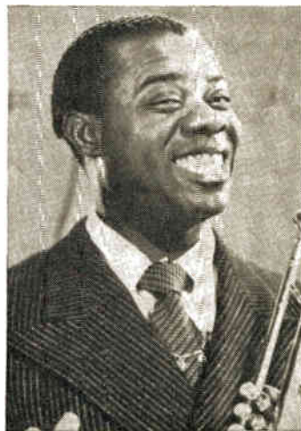
LOUIS ARMSTRONG Back with the Blues

With no "blues" discs out of Louis Armstrong during the past five years, his recent signing of an exclusive recording contract with RCA VICTOR is looked upon as a real event by blues enthusiasts the country over.