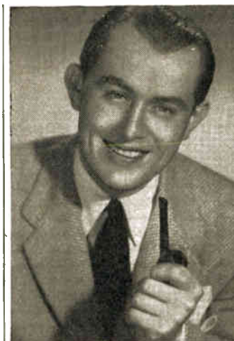
VAUGHN MONROE—"I lost a hat..."

In fact, to please everyone, at the opposite end of the pole we occasionally delve into opera with Vesti la Giubba from I PAGLI-ACCI which again seems to fill the bill with both teen age and mature audiences. You see, before I entered the popular music business I studied opera. I might be doing concert singing today except that I had to eat. Maybe if I were an opera singer I wouldn't be having my hat snatched and my tie torn both ways with my throat acting as referee, but I'm sure it