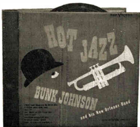
RCA Victor's Latest Hot Jazz Album (No. HJ-7)

Here at last is real New Orleans jazz by Bunk Johnson, peer of hot impromptu music.