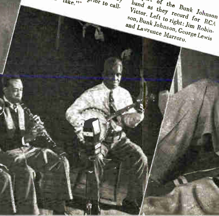
A part of the Bunk Johnson band as they record for RCA Victor. Left to right: Jim Robinson, Bunk Johnson, George Lewis and Lawrence Marrero.