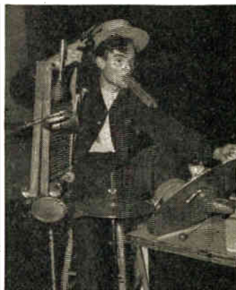
SPIKE JONES—A circus

After two years of turning a deaf ear to booking agents and fans alike, Harry James has finally agreed to tour the country in a series of one night stands. The personal appearances will begin immediately following James' current Meadowbrook (LA) engagement.