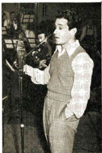
PERRY COMO—A fan "goood"