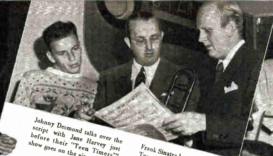
Frank Sinatra looks over ex-boss Tommy Dorsey's shoulder as Axel Stordahl, who conducts the orchestra for Sinatra, holds the score for the night's program.