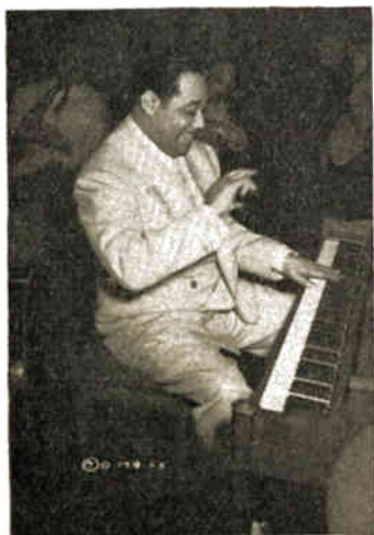
DUKE ELLINGTON—Europe beckons

The result: Ellington's next tour will be confined strictly to concerts. It is not definitely known just when this next cross country hop will begin, but it will probably take place this fall.