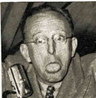
KAY KYSER—An act for the press

In a recent number of Seventeen , mag for teen-agers, Kay Kyser was featured in an article called "Minors Major with Kyser."