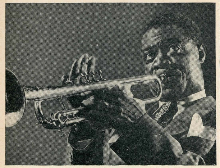
LOUIS ARMSTRONG In the lead-off spot

Look magazine, which is currently backing a contest to find the best amateur band, vocalists, novelty group, etc., in the country, recently furthered their coverage of the music biz when they ran a picture summary of the top hot trumpet men in the business.