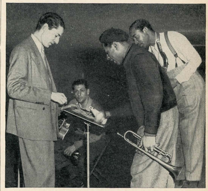
static copies of the one night LEONARD FEATHER, BILL DE ARANGO, DIZZY GILLESPIE AND DON BYAS contract. Harmonic twists and rhythmic nuances