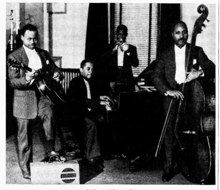
THE ARISTO-KATS This hip group of four made its premier on RCA Victor records a short time ago. It is meeting with success everywhere.