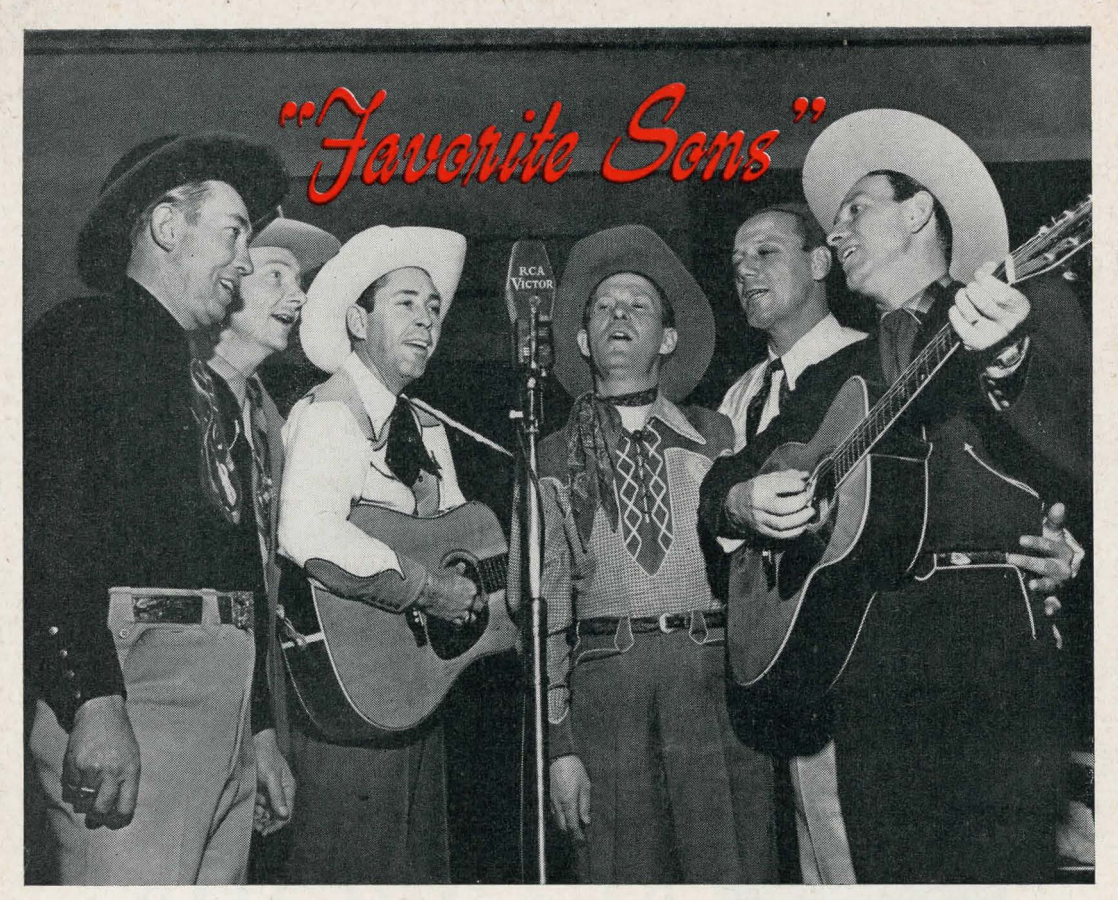
The Sons of the Pioneers celebrated their 15th birthday. See story page 10.