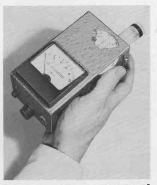
The transistorized grid-dip meter described in this article measures only 2\frac{1}{8} by 3 by 5 \frac{1}{4} inches. It can be held and operated with one hand.

Like the VTVM, the grid-dip meter has become an important instrument, actually a necessity, for all seriousminded designers and builders of multiband communications equipment. In view of the fact that valuable tubes in a power amplifier can be ruined by operation of the amplifier with a plate tank circuit incapable of resonance, a grid-dip meter is inexpensive insurance. Because this instrument can also be used for other applications such as a wavemeter, signal generator, or field strength meter,