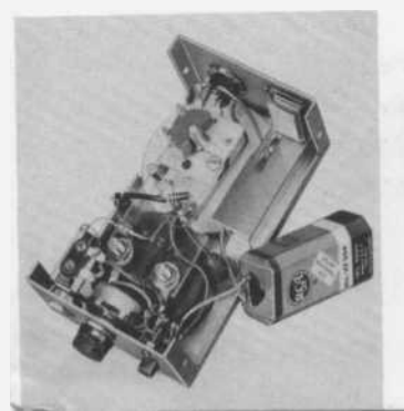
Figure 2: Bottom oblique right inside view of grid-dip meter showing parts layout. Battery has been removed to show bottery mounting platform.

Mount the coil socket so that the rotor connection of the tuning capacitor contacts pin No. 1 of the socket, as shown in Figure 3. The meter control, phone jack, and switch are mounted at the rear of the case. Bend a ¾-inch-wide strip of metal to hold the battery as shown in Figure 2. Fasten one end of this strip to the front of the case and the other end to one of the meter mounting strip should be cut away to make room for the battery. A folded strip of metal at the front of the case serves as a spring to hold the battery in place. The cover section of the "Flexi-Mount" box helps to secure the battery when the case is sealed.