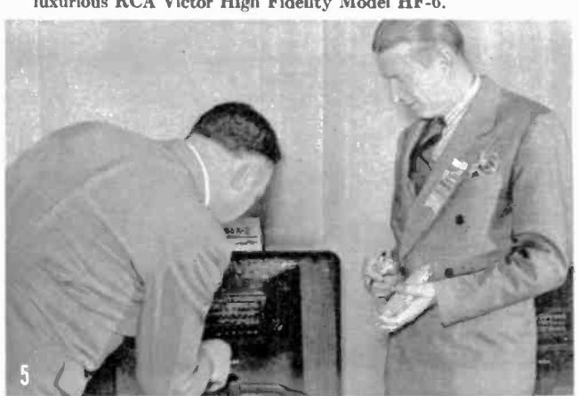
Masterly planning is seen in all the 32 new RCA Victor Electric Tuning instruments. Last year few would have thought this big Electric Tuning console 96K2 could be built to sell for $69.95*.