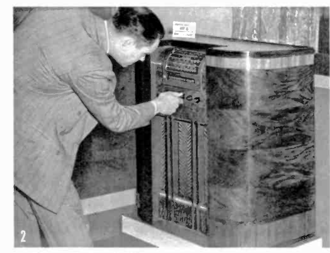
Heifetz praised its principles-The tone which last Spring won praise of great violinist is combined with a short-wave radio in luxurious RCA Victor High Fidelity Model HF-6.

No movie preview ever was awaited with more interest than that felt by RCA Victor's scores of distributors, and thousands of dealers, about these new radios. They knew that what the John Smiths want now is Electric Tuning. Could they have it? Here are some photos taken at Atlantic City 6 weeks ago and at French Lick, Indiana, 4 weeks ago, when radio distributors gathered to see how latest RCA Victor creations would answer this question. That the answer was satisfactory is attested by fact that these men placed orders for millions of dollars worth of these new instruments.