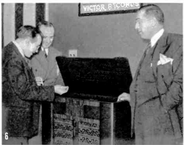
Most famous name in music takes on renewed interest with 1939 RCA Victrolas which combine radio and record playing. This model, U-128, has automatic record changer, top loading needle arm, radio with Electric Tuning for 8 stations, other ingenious features, costs only $185*, a new low for such an instrument.

RCA Manufacturing Co., Inc. Radiomarine Corp. of America National Broadcasting Company RCA Institutes, Inc. RCA Communications, Inc.