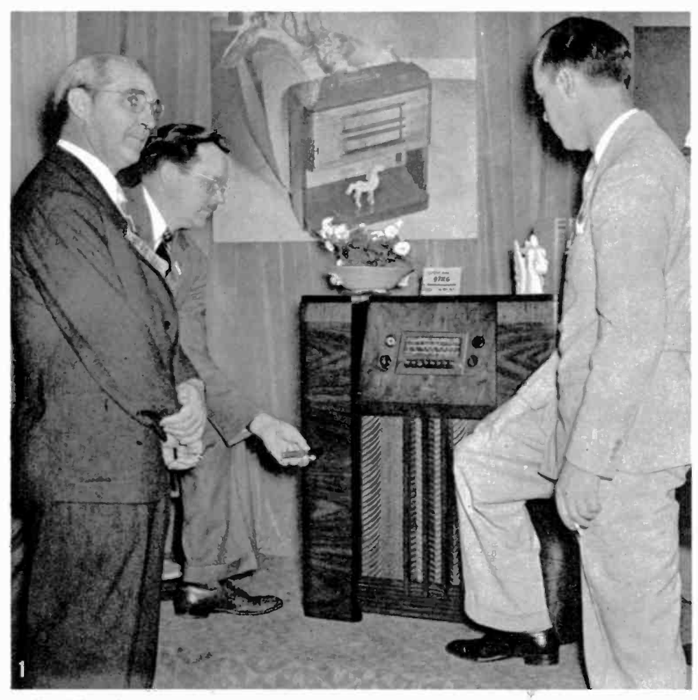
Star of the party was difficult to select among such a galaxy, but consensus favored impressive Model 97KG. Housed in a brilliant new style of cabinet, named because of its lines—the Console Grand, this instrument baffled experienced radio men who tried to guess its retail price. Its superb appearance, Electric Tuning, tone quality, and numerous features led smart judges of merchandise to estimate price at about $130. Great was the surprise when figure was revealed to be only $85*.