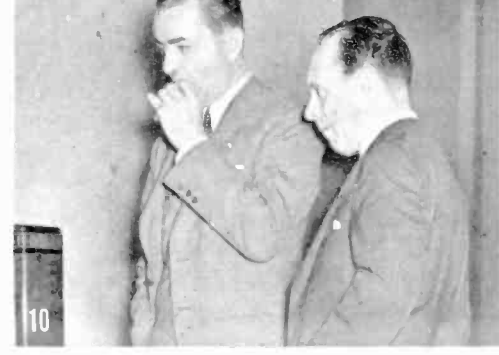
Deep meditation as distributors estimate price of another brilliant newcomer, Console 99 K (for picture and price see next page). General opinion—RCA Victor 1939 models show greatest advances ever made in one year by any set builder.