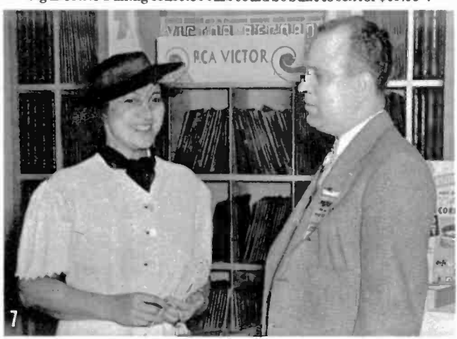
Victor Record Sales Soar - The new Victor Higher Fidelity Records are selling faster every day as millions discover joy of "the music you want when you want it" played by world's greatest artists. In background above is ideal record department planned by famous designer for Victor Record dealers.