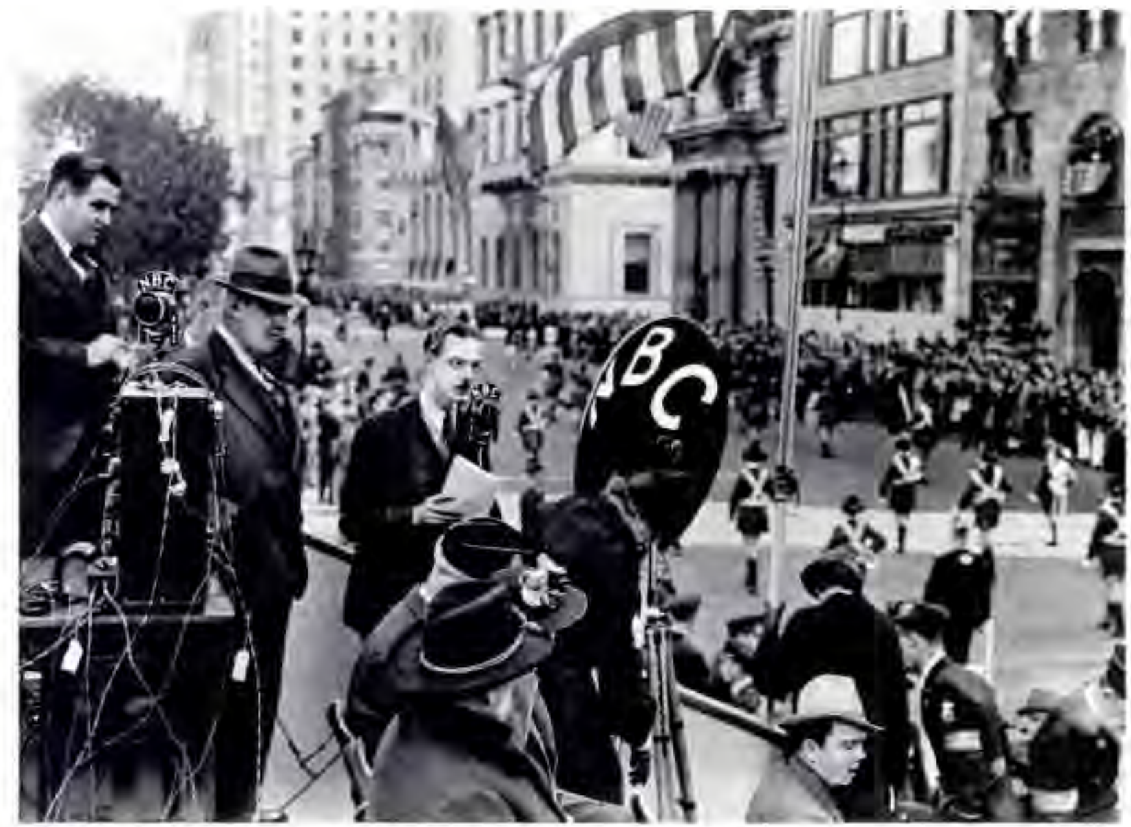
Where events or names make news. From all over the world NBC brings you first-hand accounts of what is going on. Often elaborate preparations are necessary. Special microphones and wires, or short wave portable equipment must be put in place. Typical example is shown in photo above