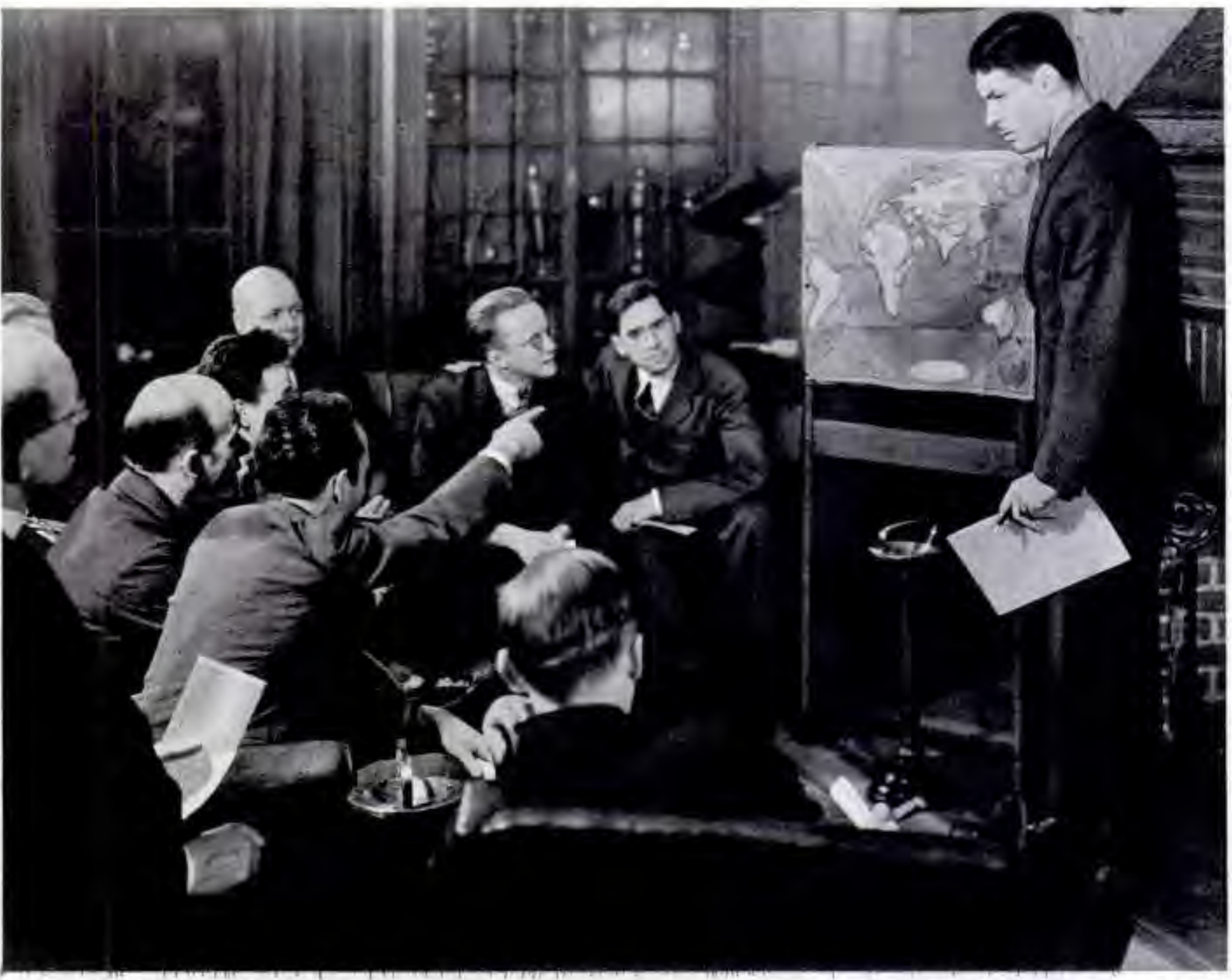
And so on far into the night. Probably no radio program has stimulated more discussion of public problems than NBC's famed Town Meeting of the Air, on NBC Blue Network, Thursdays at 9:30 P.M. (E.T.). An increasingly