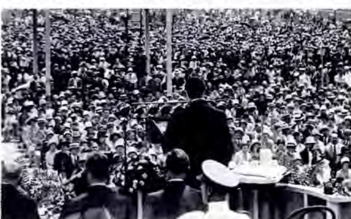
The first "must" of radio... is that the President can always have the air. But in addition to presidential messages, NBC networks constantly carry views and news of other statesmen and public leaders. So important is this service that NBC has recently opened in Washington a fine studio used largely for unsponsored programs, chiefly concerned with affairs of government.