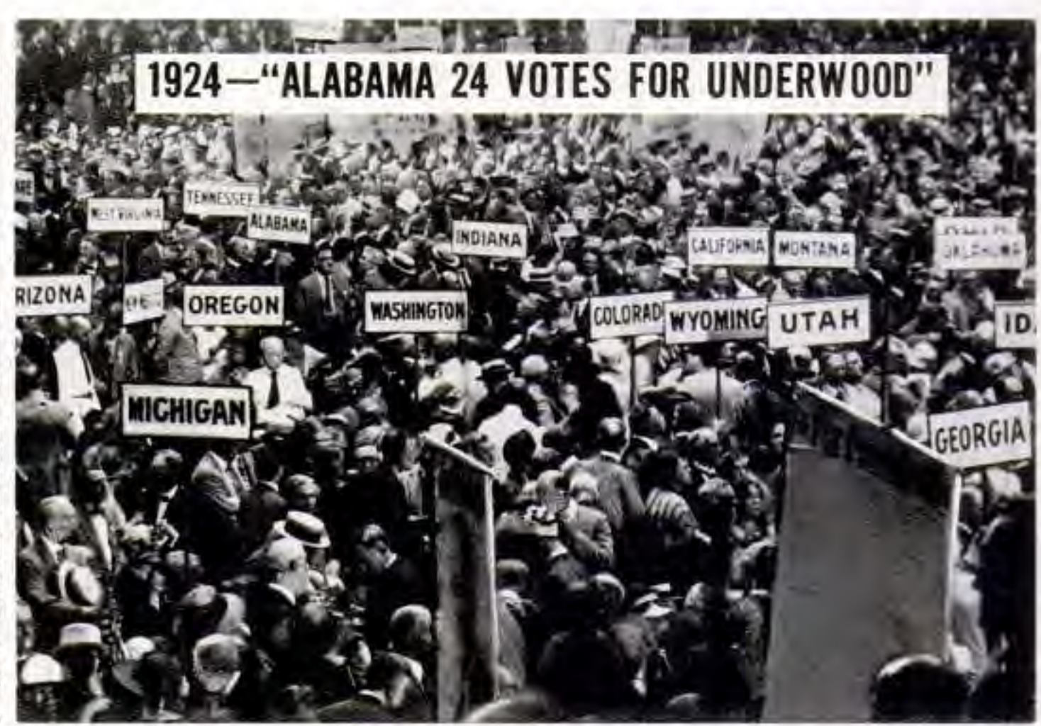
The deadlocked Democratic Convention of 1924 gave radio a great impetus—showed the public that a political convention is packed with interest. Although Mr. Coolidge and his rivals made some use of radio, there were during that summer only about 3 million homes equipped with sets. This new medium, therefore, was not of such service to the voters as it now is. Stimulated by the political campaign interest in radio swept the country, brought happiness to millions.