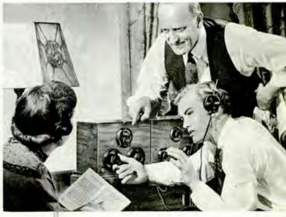
Juggler—Only a few years ago political, and all other broadcasts were heard over multiple dial instruments with headphones. To keep sets in tune, to listen and to tell the rest of the family the news called for the dexterity of a juggler. Yet even this earphone period marked a great stride forward in radio's important service of keeping the voters informed on all sides of public affairs.