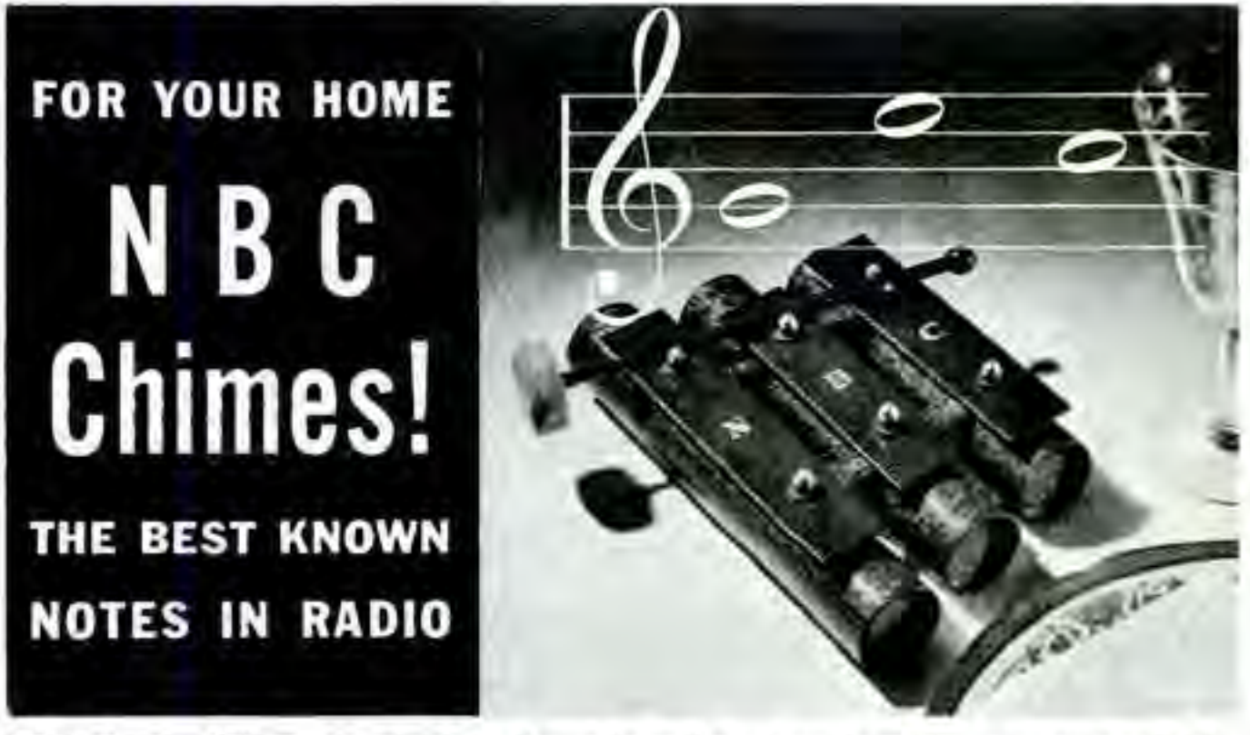
These famous chimes, signal of the finest in radio entertainment, are now available for use in your own home. Call your family to dinner ... signal your maid ... with the three notes NBC uses to tell you the time on the air. The NBC Chimes will be mailed to you promptly on receipt of $2.95. Address your remittance with name and address to NBC Chimes, Room 306, 30 Rockefeller Plaza, New York.

The greatest contribution of RCA to this public enlightenment is through NBC. But RCA serves in other ways. The facilities of RCA Communications constantly bring to the networks first hand accounts of foreign affairs. In many instances these have a direct relation to American issues. Almost universal access to radio programs is due to discoveries which have made radio sets so inexpensive that virtually every home can have one. These advances—largely made by RCA engineers—have been incorporated into RCA Victor radios. (See second following page.)