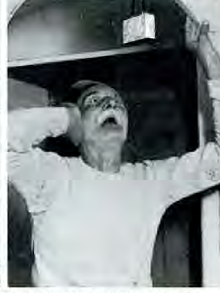
RADIO IS USED THE WORLD OVER TO PRESENT IDEAS TO THE PEOPLES OF MANY NATIONS. THE AMERICAN SYSTEM OF FREE DISCUSSION, WITH NO CENSORSHIP OF IDEAS, PERMITS TRUE UNDERSTANDING OF ALL IMPORTANT ISSUES.