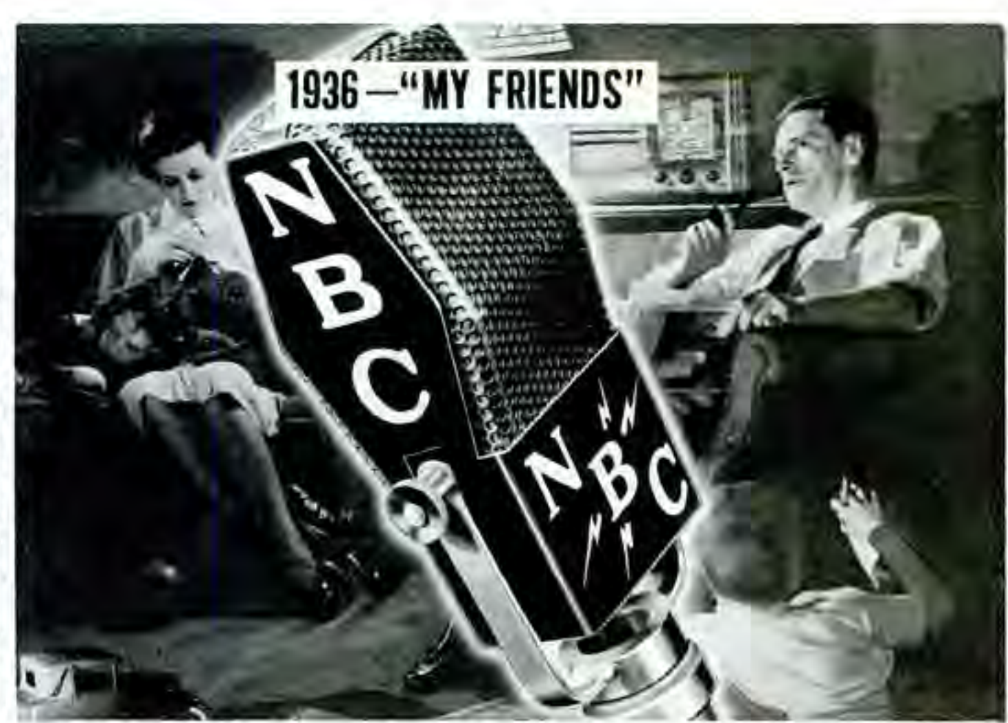
The election of 1936 saw radio advance to new importance. Network broadcasts were used, not only to present the issues, but also to inform the listeners of the way in which office holders were carrying out their tasks. "Radio personality" became a big factor. The quality of a speaker's voice, and his ability in using it, helped listening voters to form their opinions of speakers. Election day saw an all-time high in both total vote, and the percentage of eligible voters who exercised their rights.