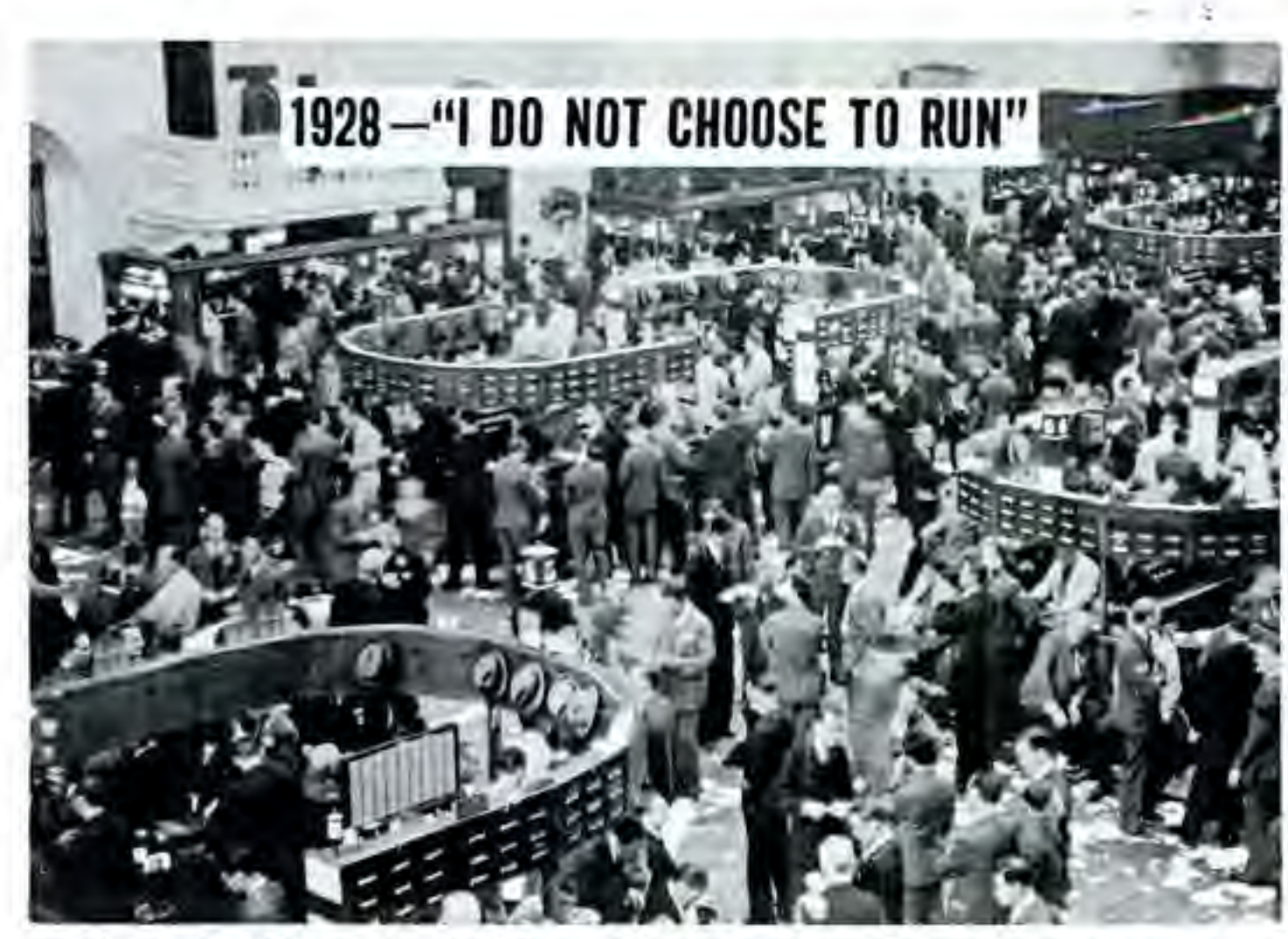
The Presidential campaign of 1928 was the first in which radio came into its own as a means of putting the issues before the public. Hotter even than political debate was the boiling Stock Market. But in spite of such distractions radio kept the voters better informed than ever before. Proof of the increased interest was seen in biggest popular vote ever cast in a Presidential campaign. Because of radio more than thirty million persons went to the polls better informed than in any previous election.