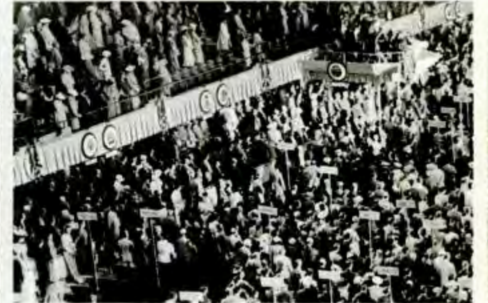
RADIO REPORTS POLITICS.

helped by radio advice and by vitally important weather bulletins. Home life on the farm benefits through housekeeping suggestions, and