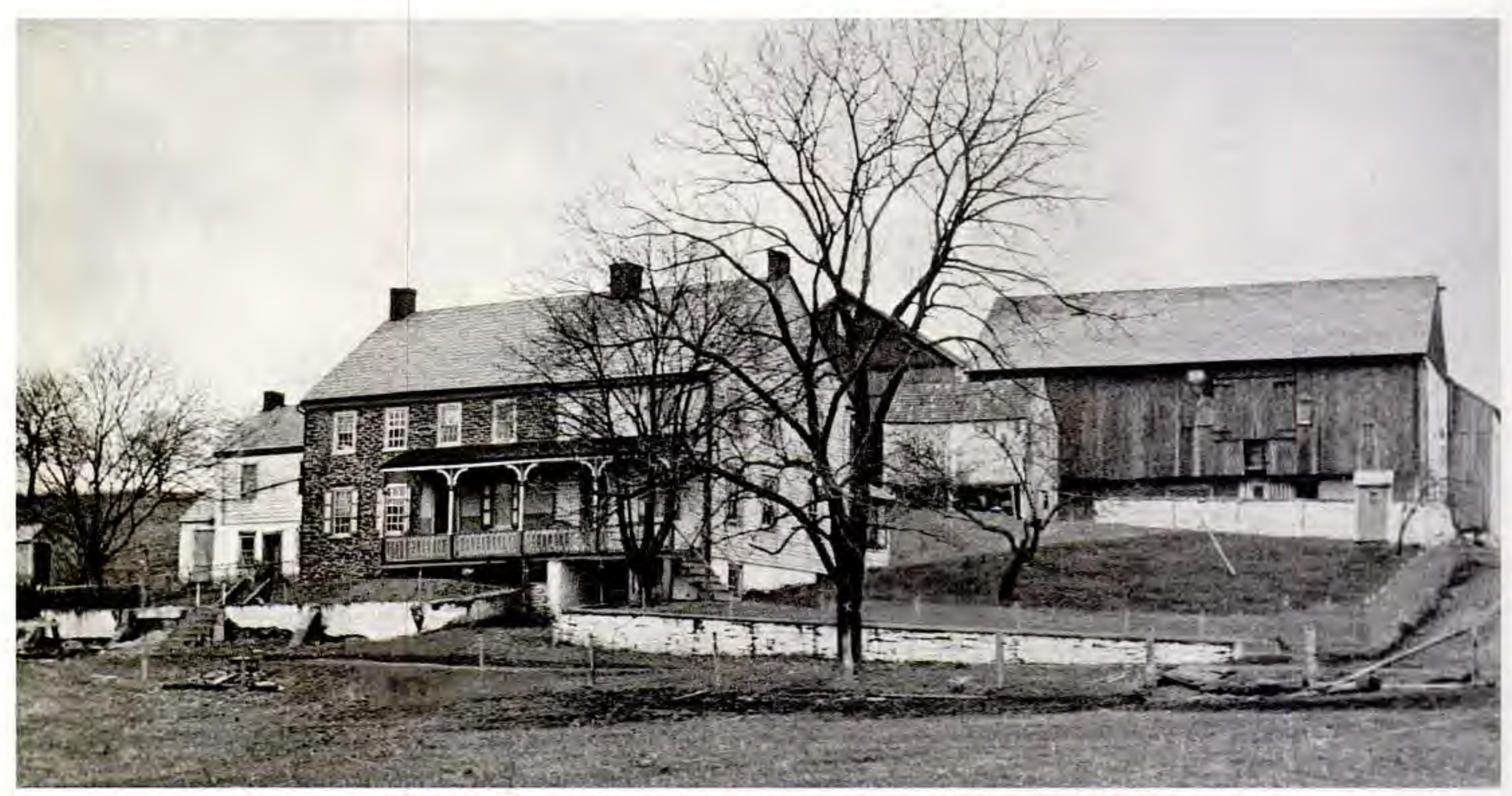
THE LEATHERMAN HOMESTEAD - IN LINES AND MATERIALS, IT IS TYPICAL OF THE PENNSYLVANIA RURAL SCENE