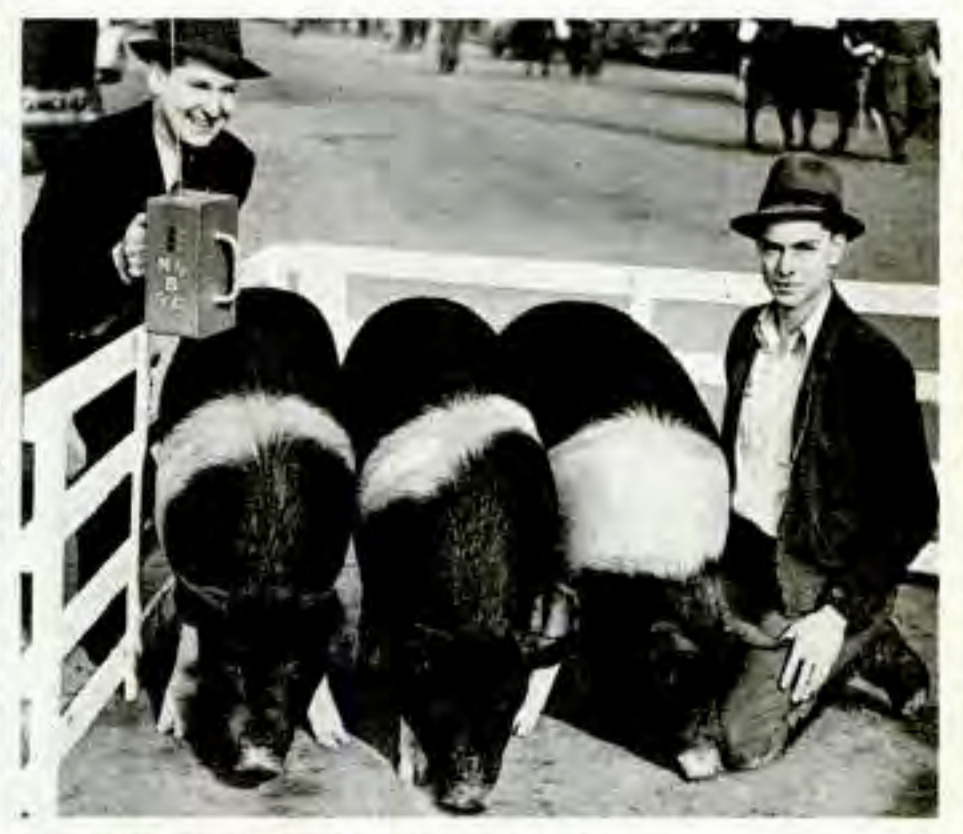
RADIO AND GOOD BREEDING.