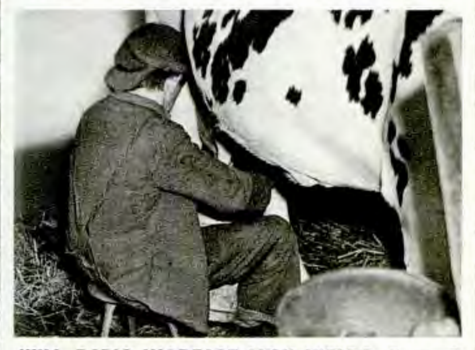
WILL RADIO INCREASE MILK YIELD? Page 2