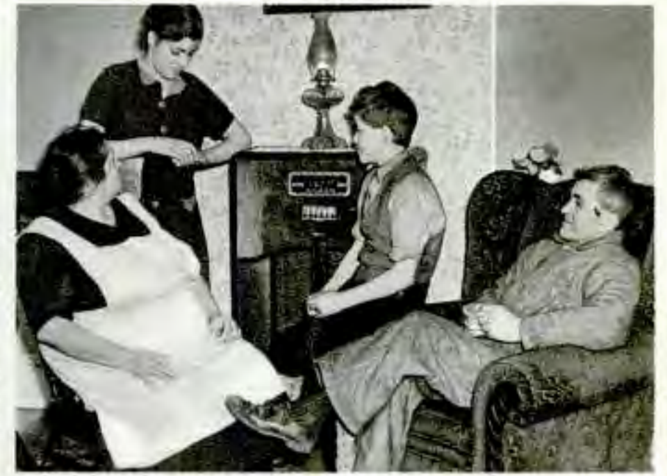
LIGHTENING THE DAILY TASKS.