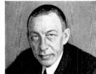
SERGEI RACHMANINOFF plays two of his own works, both with Philadelphia Orchestra.