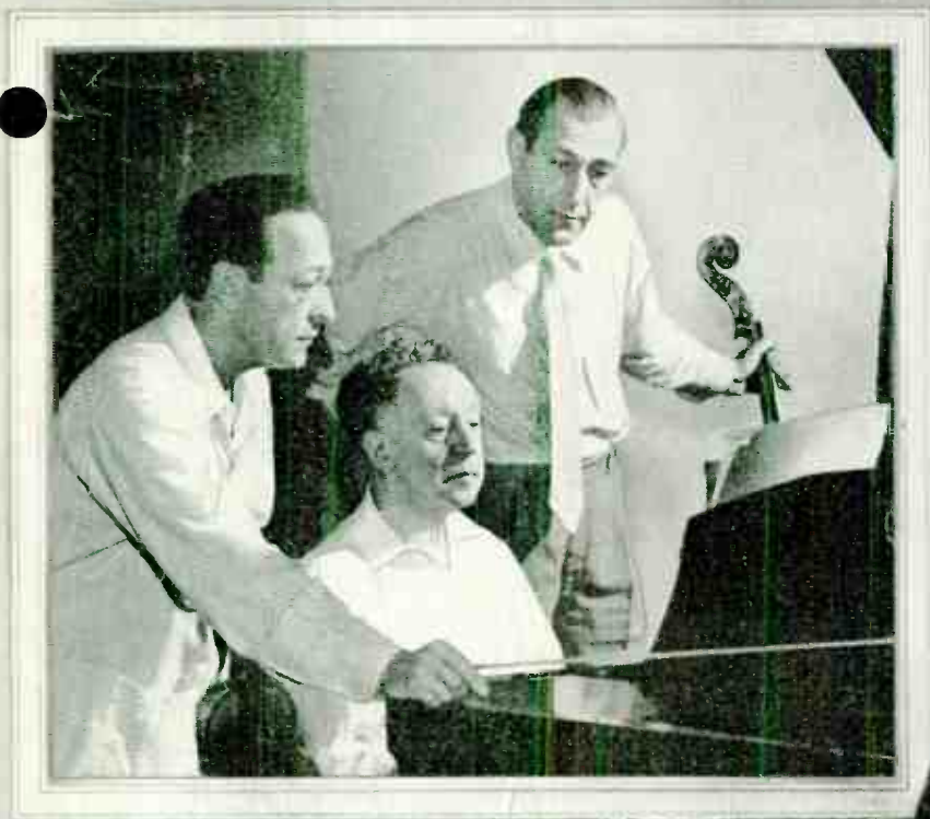
HELEN TRAUBEL and MILLION DOLLAR TRIO