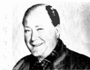
JOHN CHARLES THOMAS is heard in 3 songs from Strauss' famous "The Gypsy Baron."