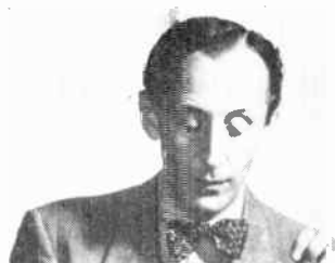
VLADIMIR HOROWITZ plays Tchaikovsky's "First Piano Concerto" with Toscanini and NBC.