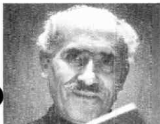
ARTURO TOSCANINI conducts in 5 albums in the first release of "Collectors' Series Issue."