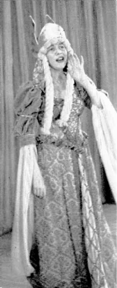
IMOGENE COCA frequently burlesques all forms of music on "Show of Shows."