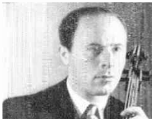
EMANUEL FEUERMANN'S cello virtuosity is in evidence in 4 "Collectors' Series" albums.