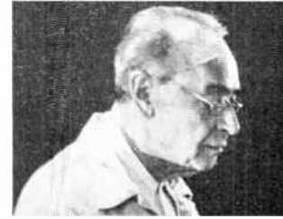
SERGE KOUSSEVITZKY conducts while Heifetz performs Prokofiev's "Concerto No. 2 in G."

For a complete list of the records and albums in the first release of this new series, see pages 8 and 9 of this issue.