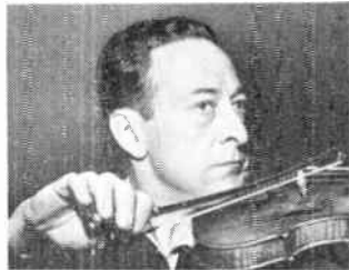
JASCHA HEIFETZ performs with Toscanini, Feuermann, Rubinstein, Primrose & Koussevitzky.