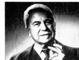
ARTUR SCHNABLE'S mastery of Beethoven is demonstrated in his "Emperor Concerto" album.