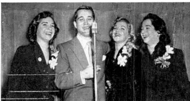
COMO & FONTANES sang an impromptu version of their record hit "You're Just In Love" for the disc jockeys, newspapermen and RCA Victor representatives assembled at the Stork Club party.

The Stork Club party was the first time that any one recording artist had been given four gold records at one time.