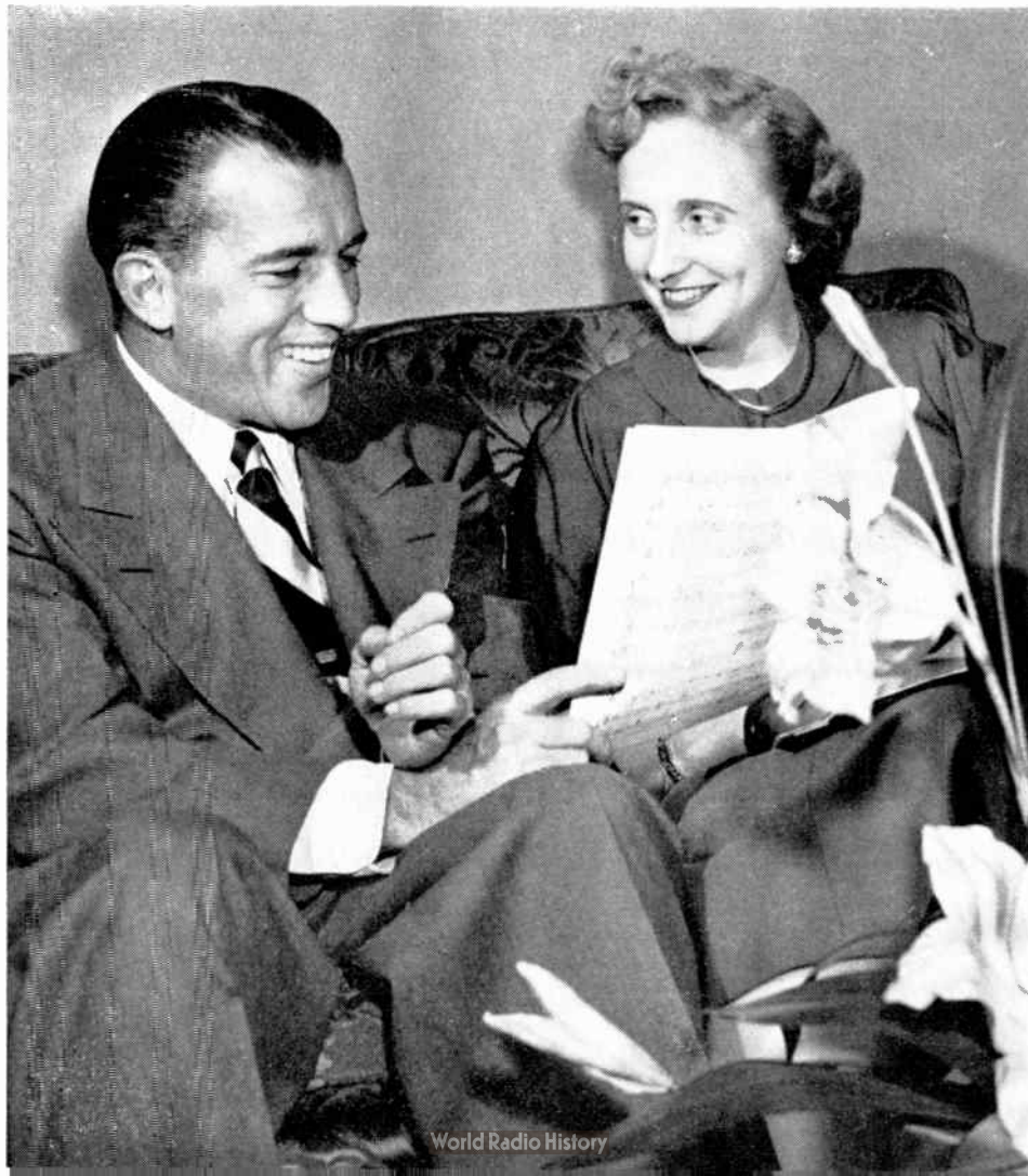
ED SULLIVAN AND MARGARET TRUMAN EXAMINE ONE OF HER "AMERICAN SONGS"