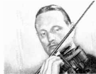
WILLIAM PRIMROSE plays the Mozart "Divertimento in E Flat" with Heifetz, Feuermann.