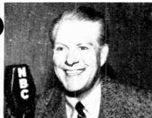
NELSON EDDY sings two of his biggest hits from the film "Rose Marie" on single disc in series.