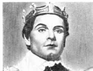
LAURENCE OLIVIER'S Academy Award winning performance in "Hamlet" is in one album.