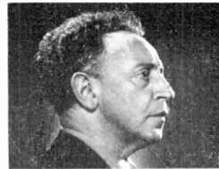
ARTUR RUBINSTEIN is heard in a Schubert Trio and two Beethoven Concertos in this series.