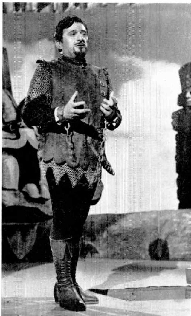
JAN PEECE IS ONE OF CONCERT STARS FEATURED IN FILM