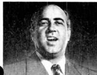
RICHARD CROOKS' "For You Alone" and "Because" are on a single disc in new series.