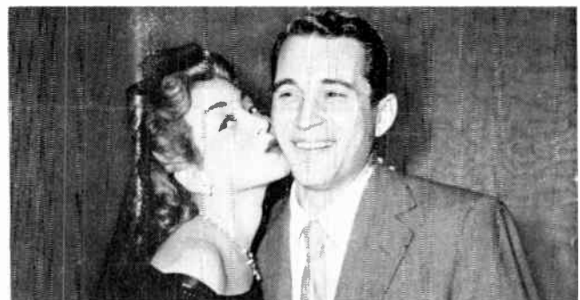
COMO & MONICA LEWIS were snapped as Monica gave Perry a kiss of congratulations. Perry has still another contender for the million sales mark in his "Zing Zing—Zoom Zoom" and "If" disc.