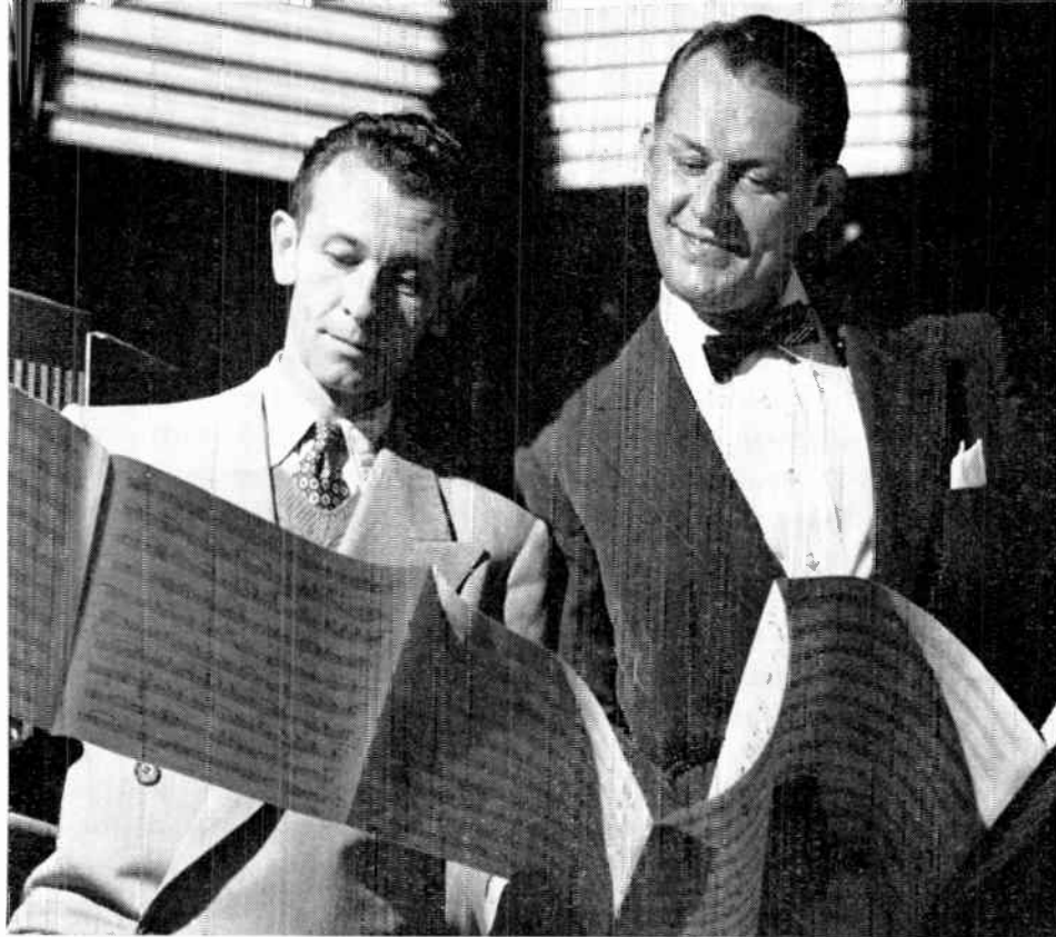
VAUGHN MONROE AND ARRANGER GENE HAMMETT STUDY A SCORE FOR A TV SEQUENCE