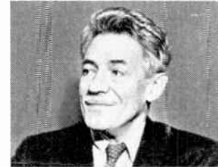
FRITZ KREISLER performs his own transcription of Dvorak's "Humoresque" in this series.