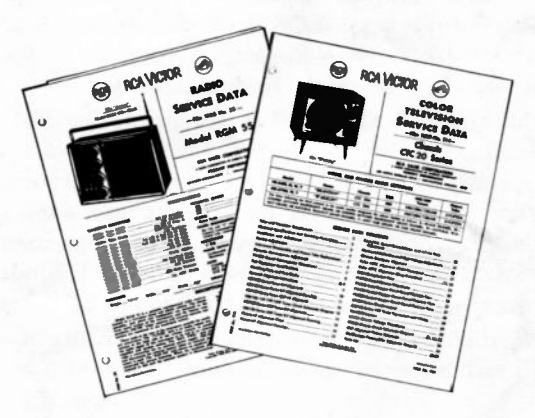
Figure 1-RCA Victor Service Data

Occasionally additional models employing a given chassis are manufactured some time after the first service data appears. Certain combination instruments and remote control instruments fall into this category; additional service data is prepared to cover such instruments. This data is referred to as a "supplementary" service data and carries a file number with an "S" number indicating that it is supplementary to the original data.