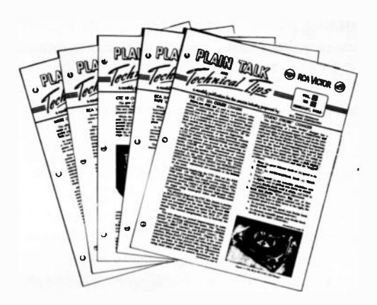
Figure 2-"Plain Talk and Technical Tips"

"Plain Talk" includes new product information on recently announced RCA Victor instruments, such as new chassis used in Television and Radio, simplified explanations of new circuitry, descriptions of new tubes and components, and new test equipment in-