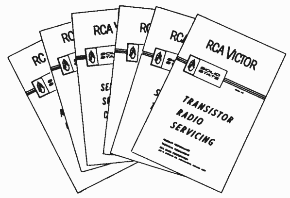
Figure 3-Six Solid State Booklets

These booklets describe a basic transistor concept and cover related circuits and servicing techniques in a practical manner that minimizes the complexities of the transistor.