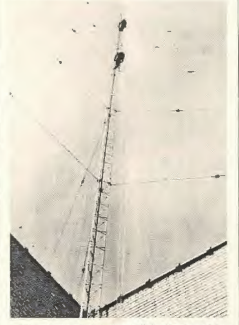
The above photo shows John Dickey at top and Fred Coble completing installation of the antenna.

With an elevation of only 267 feet at a distance of 75 miles from the nearest broadcast station in New YorkCity the job called for the erection of a 125 foot tower. This increased the signal strength from 75 microvolts to 300, and provided satisfactory reception for the customer.