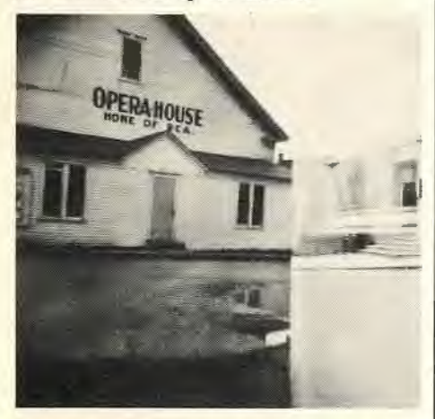
P. E. Woodman sends this snapshot of the Opera House in Millbridge, Maine.

In case there is any confusion as to where the "Home Office" is located the photo below should clear up the matter.