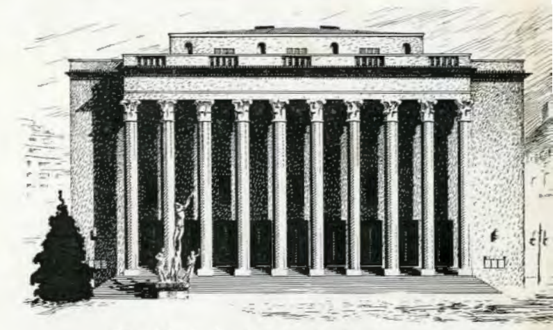
Stockholm's Concert House