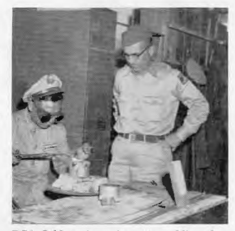
RCA field engineer inspects welding shop

come next, followed by inspection of a transmitter, which has been torn down. parts electroplated, chassis and cabinet painted. This joh includes four RF units, one modulator and power supply.