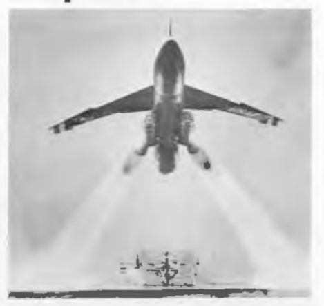
The SNARK Missile . . , its range is in excess of 5,000 miles

"This is but one of the series of major operations which this Center must support with equal facility in the months to come, if we are to fulfill our responsibility to the Department of Defense. The success of the Range in this important test greatly strengthens my conviction that AFMTC will be equal to the challenges of the future."