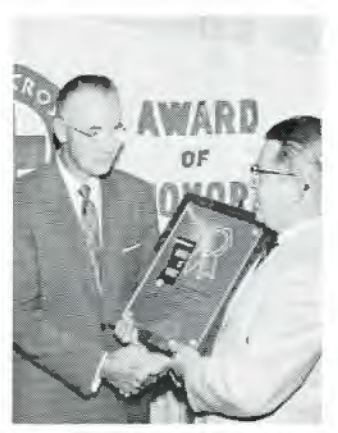
Accepting a National Safety Award