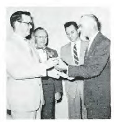
Presenting the President's bowling cup