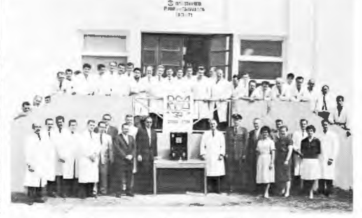
DOUBLED—Government Services' Chateauroux (France) facility achieved a 100% increase in number of equipments serviced in past year; pose pridefully with the twenty-thousandth item completed.