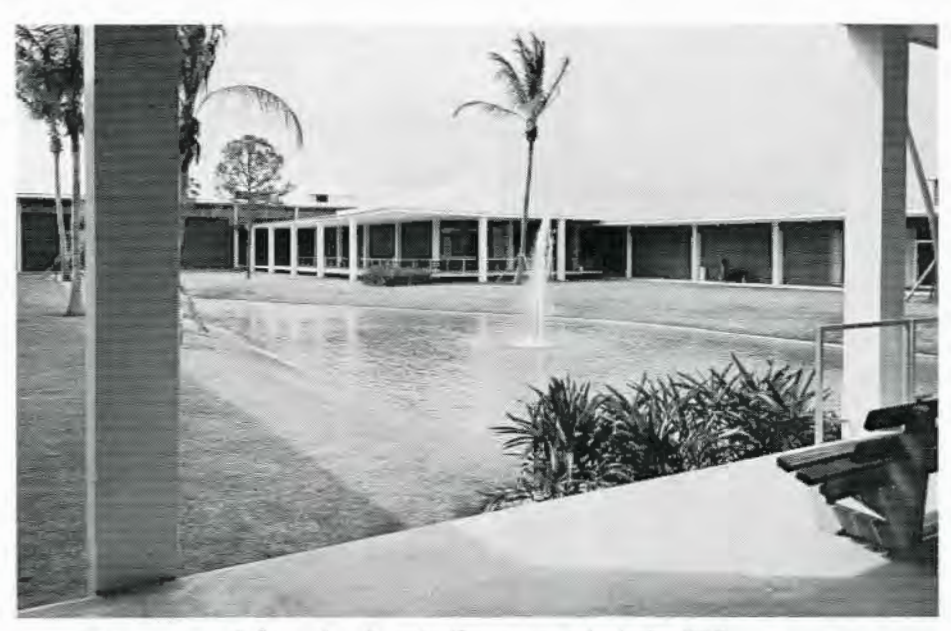
A fountain plays in the courtyard of the EDP manufacturing facility at Palm Beach Gardens.

"Evidence now at hand suggests that in flight the bat finds his way by bouncing ultrasonic waves off solid objects; the pigeon homes on the magnetic lines of the earth; a bird flies thousands of miles from the tree