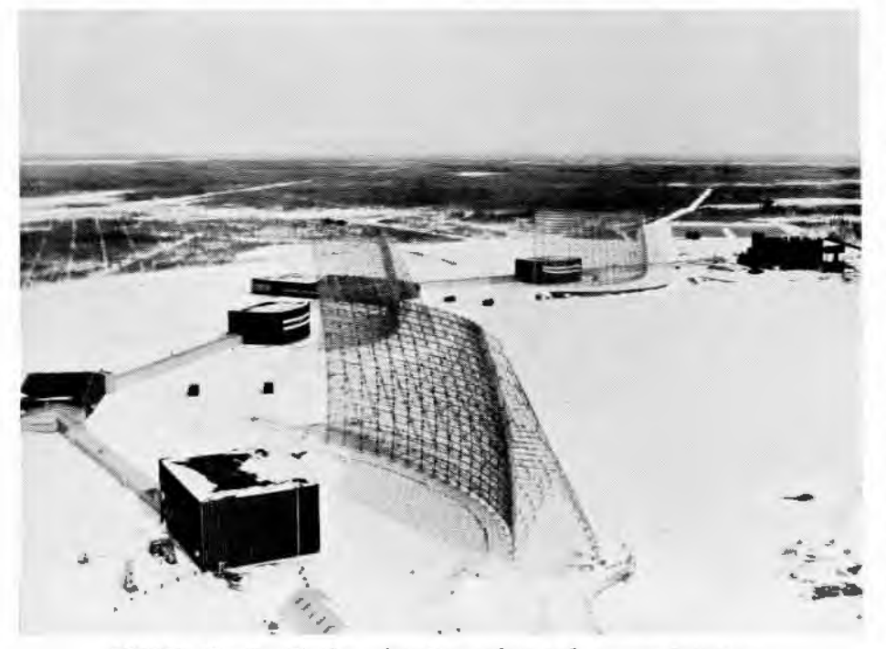
BMEWS Site II with three detection radars and scanner buildings.

On the way his father, pulling the boy's tongue back, used mouth-to-