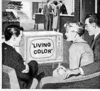
RCA VICTOR "LIVING COLOR" TV is a proven traffic builder. Perfect for lobbies, restaurants and luxury suites. Like two sets in one, Living Color TV brings you superb b/w performance too! Smart table model styling, in several popular furniture finishes. Legs go on or off with ease.