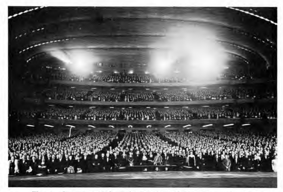
The vast dimensions of the Radio City Music Hall are a consideration when changes in sound equipment are contemplated.

Seat phones, call systems and intercoms are in constant use, and help to make the Music Hall assignment more than routine for the RCA servicemen.