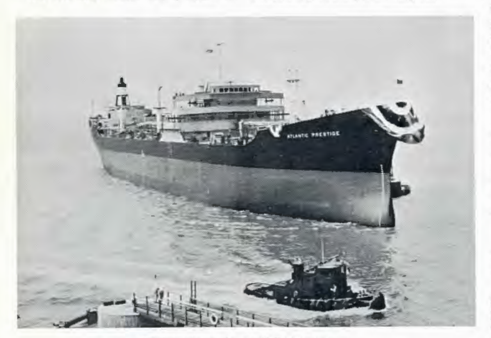
SUPERTANKER SS. PRESTIGE of the Atlantic Refining fleet, has most modern communications equipment available.

Its plants are located in Massachusetts, New Hampshire, Long Island, California; its warehouses and sales offices at Chicago, San Francisco, Houston, Pittsburgh, Atlanta, New York, Cleveland, Detroit, Philadelphia.