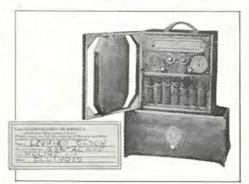
COUPON clipped from ancient ad was received at RCA-Cherry Hill last month.

A probable all-time winner for longterm pulling power is the ad shown below, placed a quarter of a century ago by RCA to advertise its new portable model of the Radiola Super-Heterodyne. The coupon requesting further information was received in Cherry Hill in October of 1962, There's a great big wonderful world waiting for the inquiree!