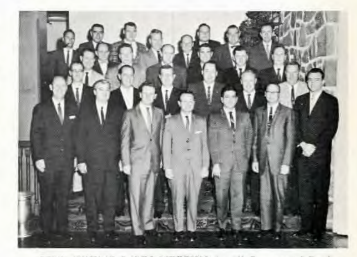
... SEMI-ANNUAL SALES MEETING for all Commercial Products District, Regional, and Sales Managers, at the Cherry Hill Inn, late October.