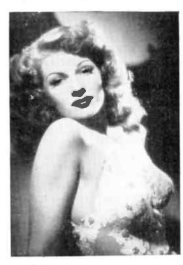
delectable and dee-lovely are three of the adjectives that first come to mind in any attempt to de-scribe the talents of beauteous Rita Hayworth, popular screen favorite.