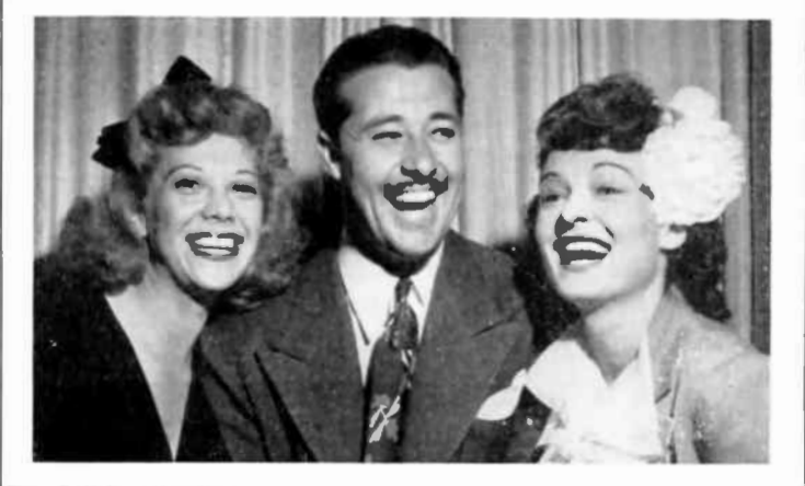
dwarfed television within a year after its inception. The particular phosphor is a beryllium-containing "What's