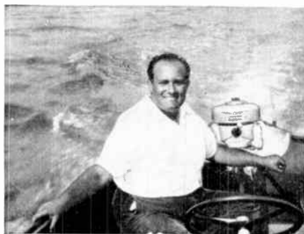
Leonard Warren in one of his relaxed moments.

Ask for Sea Shanties , MO-1186, or the album's two features — Blow the Man Down and The Drunken Sailor , 10-1500. This is music for everyone — young or old!