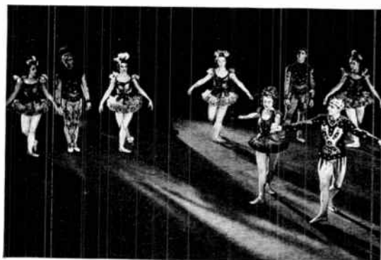
Scene from Ballet Russe de Monte Carlo production. In the foreground are Frederick Franklin and Alexandra Danilova.

It is our privilege to offer this album of Stravinsky conducting his own music, the second in recent months. The other was the lovely Divertimento from The Fairy's Kiss (M/DM-1202). Danses Concertantes appears in album (M—$5.75, ▲ DM—$4.75▲). The final side is the Scherzo à la Russe .