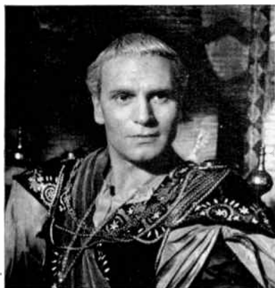
Laurence Olivier in ceremonial garb of the Prince of Denmark

Following in the triumphant path of Henry V , Laurence Olivier offers his motion picture version of Shakespeare's Hamlet , a Two Cities Film for the J. Arthur Rank Organization. In addition to playing the title role, Olivier also produced and directed the film.