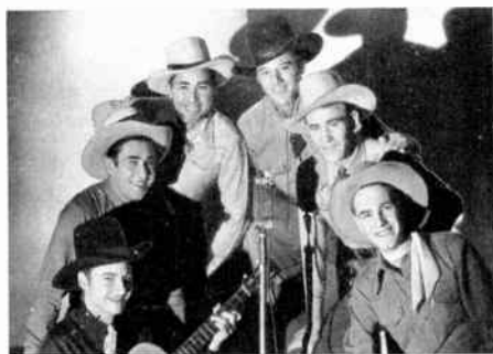
The Sons of the Pioneers

They have contributed many of America's most popular new tunes—among them, the famous Cool Waters . This month, RCA Victor commemorates the happy anniversary occasion by issuing their latest recording— My Feet Takes Me Away , backed by The Missouri Is a Devil of a Woman . Ask for record No. 20-3082.