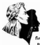
finest tone system in RCA Victor history

Plays on AC or DC house current or on its long-life RCA battery. Lightweight—in durable maroon plastic with non-tarnish golden finished trim and a handsome saddle of smart luggage-type covering. It's a welcome companion at home or wherever you go! $34.95* less battery.