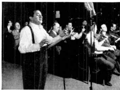
Jan Peerce at a recent RCA Victor recording session.