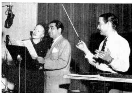
Dorothy Kirsten, Robert Merrill and Russ Case

Two of the Metropolitan Opera Company's most attractive young singers make their third duo-recording for RCA Victor. Romberg's When I Grow Too Old to Dream and the beloved Wanting You from The New Moon make up this ten-inch disc. Russ Case and his orchestra assist. Ask for Record 10-1423; the list price is $1.00 ▲.