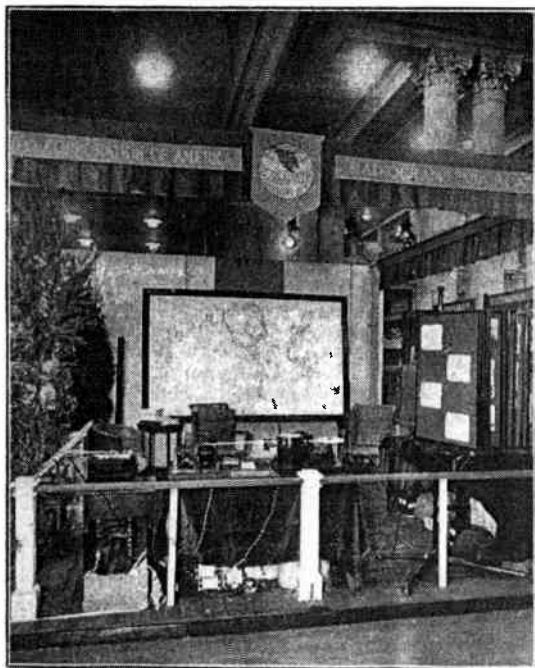
RADIO CORPORATION EXHIBIT—TRAVEL SHOW. NEW YORK