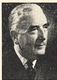
The Prime Minister of Australia, Mr. R. G. Menzies

In Melbourne, the temporary Federal Capital, on May 9, 1901, the Duke of York (later King George V) opened the new Parliament in the Exhibition Building in the presence of 12,000 people. Subsequently, until 1927, it sat in Victoria at Parliament House.