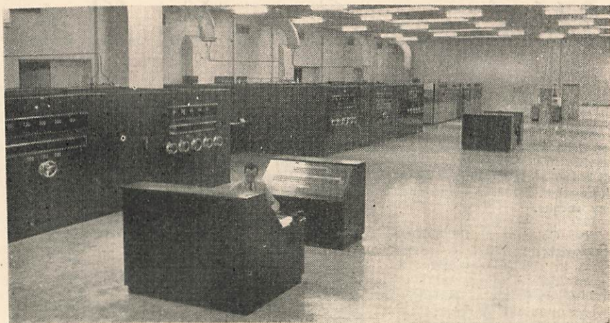
The high frequency transmitting station at Shepparton, Victoria. This view of the transmitter hall shows, from left to right, "Radio Australia" transmitters VLA 100 k.w., VLB 100 k.w., and VLC 50 k.w.