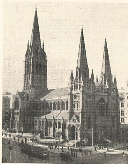
St. Paul's Cathedral, Melbourne

Judging by the numbers of letters received from listeners in all parts of the world, the various devotional programmes transmitted in the General Overseas Service by Radio Australia have a wide appeal. Listeners in remote areas have spoken of the immense spiritual help these programmes bring them.