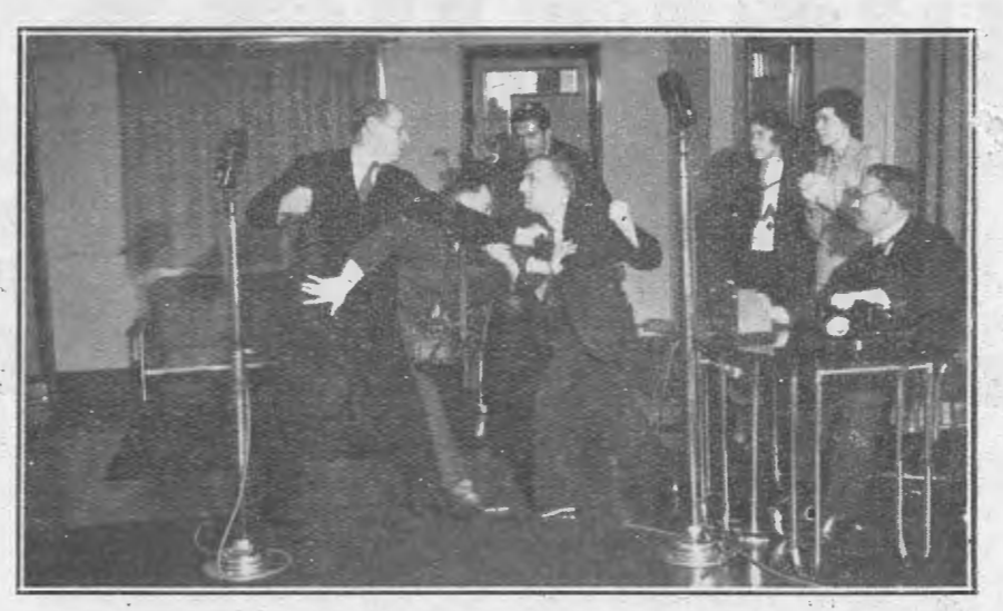
ACTORS GETTING EXCITED BEFORE THE 2UW MIKE

A point that greatly impresses every visitor is the fact that beyond the transmitter is the room containing the power plant—2UW's being one of the few plants in the State that is entirely selfcontained—that it has the power, trans-