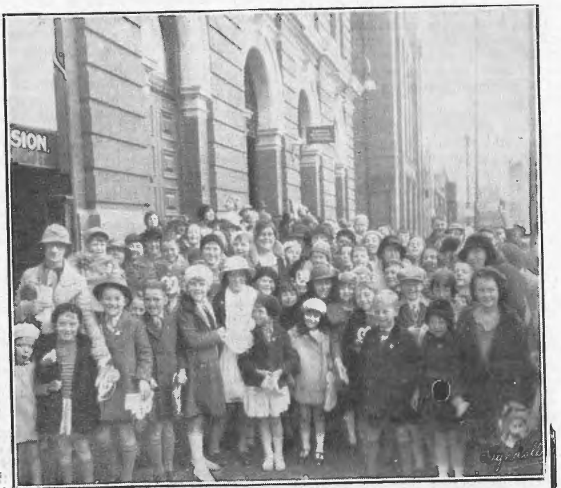
2HD's NEWCASTLE JOY CLUB PARTY, WAITING TO GET INTO THE CENTRAL HALL

"Flop" is a thoroughbred retriever, and was originally named "Ambrose Umphil-bee." He secured his nickname "Flop" as a result of his extreme laziness for the as a result of his extreme laziness for the first few weeks of his residence at 2BH station. He has now become acclimatised however, and is to be seen scampering over the hills which surround the station, until just at the commencement of the Children's Session, when he presents himself at the studio door and plays his part in barking and wagging his tail furiously for the kiddies. He apparently gets as much enjoyment out of this Children's Session as the "kids" do themselves.