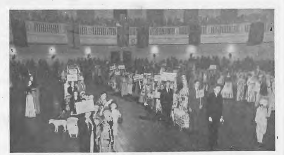
At the 4BH Kookaburra Club Fancy Dress Ball, Brisbane Town Hall.

The membership of the club is steadily growing, and just on 8,000 names are now on the register. The Kookaburra Club has proven an excellent publicity medium for the manufacturers of this product.