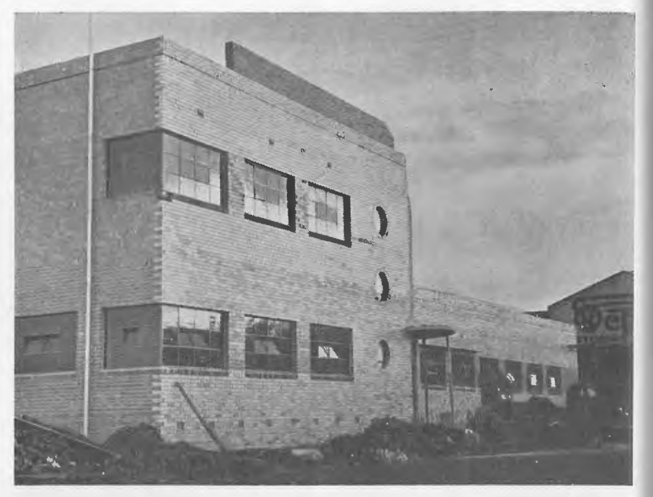
Rapidly nearing completion is the new T.E.P.L. factory, Doonside Street, Richmond, Victoria. Illustration shows the modern and distinctive lines of this up-to-date factory for the manufacture of broadcasting equipment and associate products.