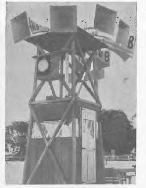
4MB's Showground P.A. Set-up.

The Childers Show completed six full consecutive days of O.B., and when the dust, the heat and the infernal din of the showgrounds had passed on, a strange quiet appeared to have settled