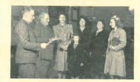
Top picture shows the "handful" of cheques collected from the N.S.W. State Lottery by the Maxam Syndicate, and below the five lucky shareholders of the £1,000 prize being presented with their shares in the 2SM studio.