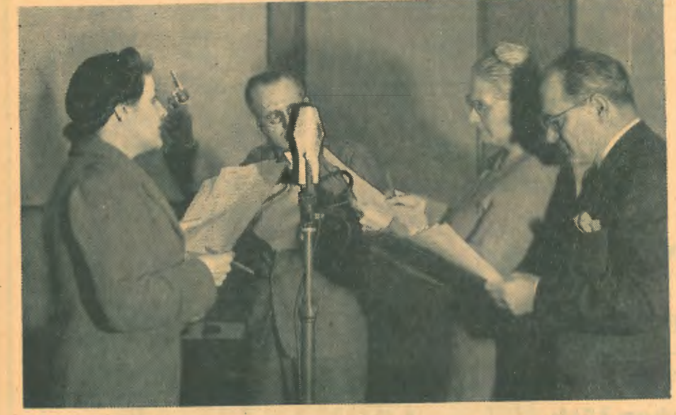
The cast of "Dr. Mac" makes an episode in this popular serial in Studio "A" where modern acoustic treatment is considered the first element in the recording of high fidelity sound. The brains of internationally famous acoustic engineers stand behind your guarantee of A.R.C.'s recording quality.

AUSTRALIAN RECORD COMPANY PTY. LTD., SYDNEY