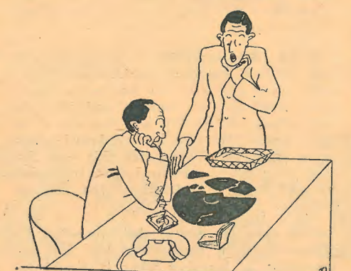
"Gosh! We've broken "The Live Artist Hour."