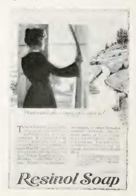
Note the Author's reference to this advertisement

Suppose, for example, that I am a maker of children's clothing, including blouses, which I am anxious to proclaim to the world are built especially for the boy-business-the materials will stand wear and tear, the colors are fast, and even after rough usage the blouses will keep their shape. I want to appeal to probable buyers, and my ad-story will appear in June, July and August. These are my facts; now for fiction. I am in search of one of those facets of life previously spoken of. What did I do in summer when I was a boy, that boys everywhere still do, and that just about used up any ordinary garment? What one thing did I do especially: I went to the "old