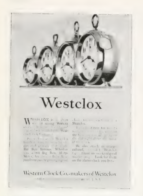
The Westelox advertisement mentioned herein.

with the truth in your advertising your copy will ultimately and deservedly be discounted.