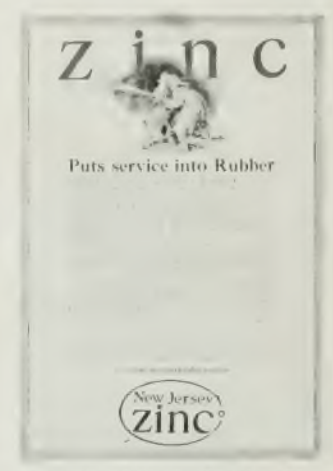
Every line of this "copy" carries selling punch in the prospect-reader

The tendency shows itself in varied ways. Take the advertisement of a certain automobile. It offers a catalogue. But the copy doesn't say a single, concrete thing which would impel me to ask for the Looklet. Every statement is a generality unbacked. In contrast to it, another motor-car advertise-