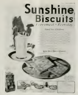
Strongly a piece of "selling copy," even to the good, old-fashioned coupon in the corner

The Ingersoll advertisement is another. It talks price; it gives reasons; it tells what sort of work this or that watch can best do. The Vivomint advertisement isn't "above" running a coupon at the bottom and a paragraph in the