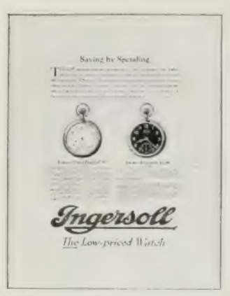
The percentage of selling efficiency of this "copy" is very high and returns prove its good quality

Brass Tacks. So we are all substituting Round Numbers.