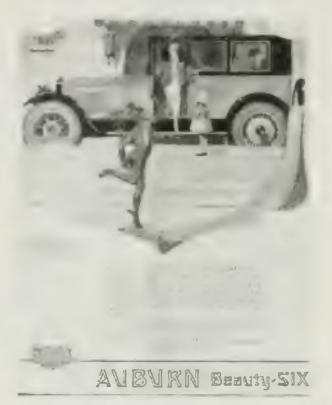
The use of good art and excellent typicaphy have not robbed this "copy" of its "selling power"

There are some strenuous selling days ahead. We're all going to quit cutting down orders, except the paper makers, and stiraround for an outlet for our stocks.