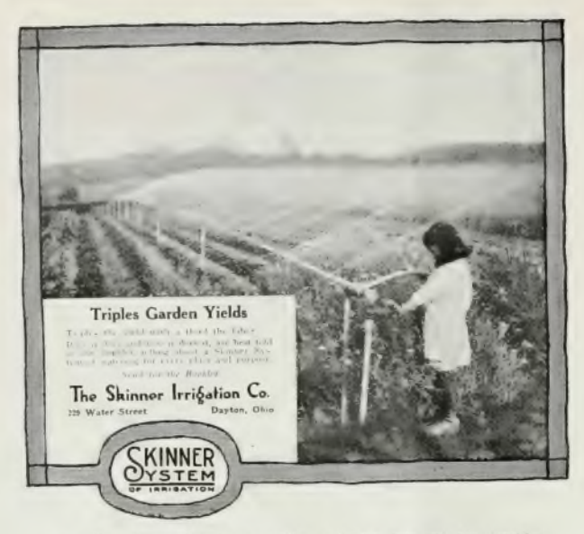
The illustration catches the eye, strikes a familiar note and wins inquiries

should be given to the mere photograph. The photograph—nearly any face would have done—stamped the advertisement as genuine and real."