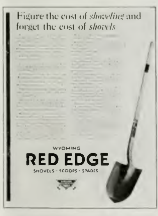
Copy that focuses the reader's attention on ultimate costs

"Our advertising and the efficient merchandising of it has added about forty new Red Edge distributors to