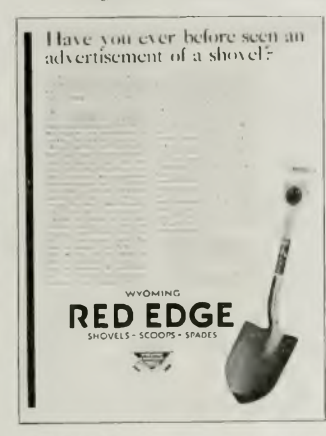
This is the first shovel copy to oppose in a general magazine

But it was the July advertisement that brought out the heavy artillery among the Wyoming sales arguments. A black headline across a full page badeshovel users