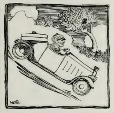
Going down hill he Used all Six Cylinders.

T HERE once was an Automobile Driver who used all Six Cylinders going Down Grade, but when he came to a Hill he took the wires off two Spark Plugs and tried to negotiate the hill on Four Cylinders. You will agree that he was a Pretty Foolish Driver.