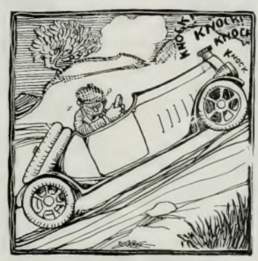
When he struck the Upgrade he deliberately took the Wires off two Spark Plugs.

"With summer coming on and the market slowing up we've started advertising big. We are running more and larger copy than we used last winter. Our business is brisk. We sold more cars in August than in June."