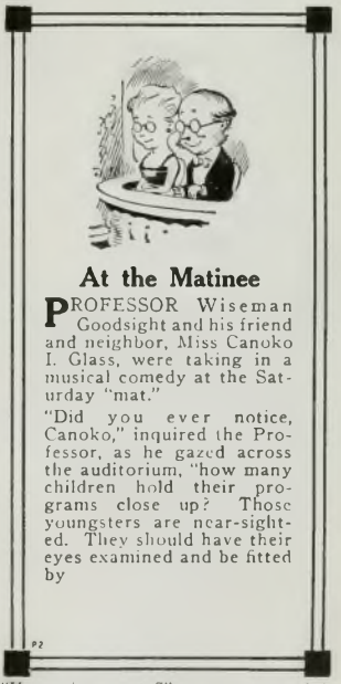
"Human interest stuff" to put over a vital message on children's eyes

We have been both criticized and commended for our action in charg-