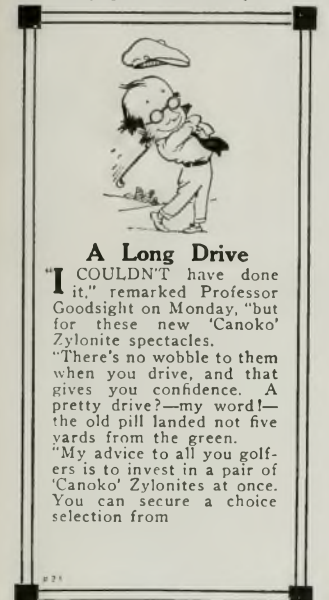
How the Professor's "golf humor" is made to sell a special type

Instead of preparing a portfolio of proofs only of newspaper copy, street-car cards, etc., we decided to present our advertising to the dealer in a more attractive way. We also wished to include some selling talks on the advertising itself, as well as a few pages advertising certain