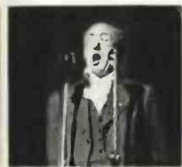
In There Pitching—Elderly contestant gives forth with his "Sunday Best."

that the anxious fellow is thinking: "that ain't me." After the play-back is completed, the audience, by applause (recorded on the applause meter), selects the winner.