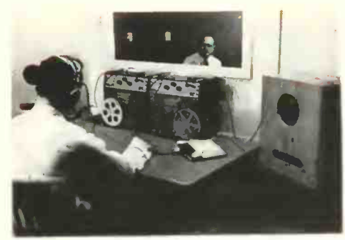
Stereophonic recording equipment in use at Psychology of Music Laboratory, University of Kansas. Set-up shown includes two Pentroo recorders in tandem, matched right and left field speakers, and binaural headset.

Stereophonic sound is not new but how to demonstrate its function in normal hearing has been difficult and expensive. The effect of two-eared orientation to a complex sound field and especially to music is of much concern to the staff of the Psychology of Music Laboratory at the University of Kansas. The task of affording classroom demonstration of stereophonic effects has been simplified by the pre-recording of various types of sound and the presentation of these materials both monaurally and binaurally. Of particular interest is the contribution of stereophonic principles to recording and transmission of music. Orchestral music so recorded seems to possess a vitality and brilliance far beyond that of our finest high fidelity single channel recordings. Even with limited fidelity of equipment the two-channel system affords a subjective realism and vitality to the recorded sound not experienced in present