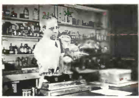
Laboratory demonstration showing precipitation ol magnetic oxide used in Audiotape coating.