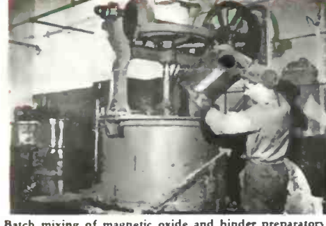
Batch mixing of magnetic oxide and binder preparatory to ball milling.