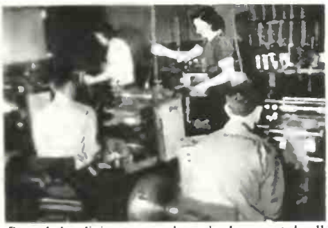
Part of the slitting room, where the large coated rolls are slit to the required width and wound on reels or hubs.