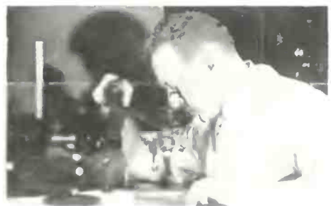
Microscopic examination of production sample of Audiotape—checking for particle size, uniformity of dispersion and freedom from "clumping".