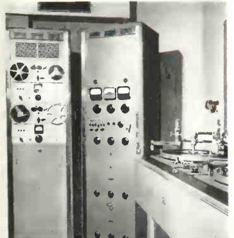
The "business end" of WMBI's sound recording room, showing rack mounted Magnecorder tape machines, audio amplifier equipment and two Presto disc recorders.

by Lorna Lee Macfarlane Moody Bible Institute Chicago, Illinois