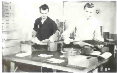
Part of the Audiotape packaging department, where reels are boved and packed in cartons, together with actual Esterline Angus output curves of one of the five reels in each package.