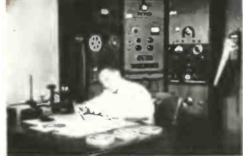
A section of the electrical testing laboratory where finished tapes from every batch must measure up to the highest standards of performance.