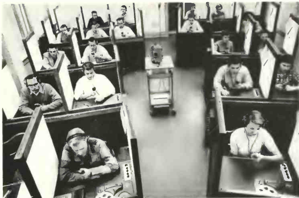
A portion of Purdue University's new electronic language laboratory, showing 23 of the 28 semi-soundproof recorder booths with front panels lowered.

The switching system of the Laboratory is custom designed and permits complete flexibility in the use of the equipment. One important asset of the system is apparent in that each student is in contact with the instructor by way of his earphones for every minute of the class period. Moreover, in supplementing this electronic communication, with the individual recorders in operation the students respond to the instructor's questions and directions while