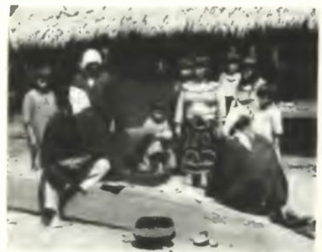
Shipibo Indians listen to a phonograph record made from the tape recording in their own language. Taken at Roahoya, Peru.