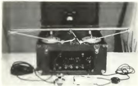
Tape Recorder replaces the patient and the output goes to the stethophones (one illustrated) and also to the Educational Cardioscope where the sounds are visualized on the face of the special picture tube. In this illustration a continuous tape is shown in position which will play 30 seconds at 3\frac{3}{4} " or one minute at 1\frac{7}{8} ".

time to become accustomed to the sounds. Most of the recording is done at 3\frac{3}{4} " or 1\frac{7}{8} ", which enables us to put a lot of material on a 7 inch reel and which does not detract from the low frequency response.