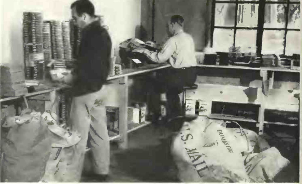
In a corner of the shipping department of Magnetic Sound, Inc., sound tapes are boxed and labeled for mailing to radio stations throughout the nation.

"And," he adds, "as production increases, we plan to make a further reduction in charges for our services."