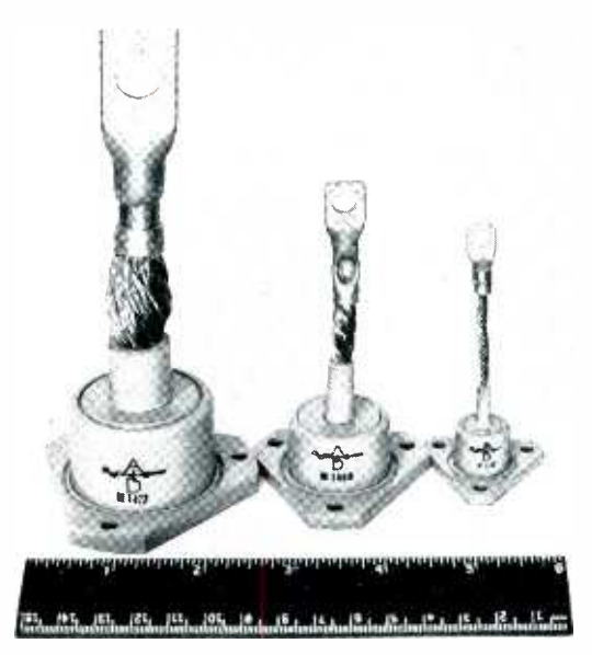
New high current silicon power rectifiers introduced by Audio Devices include models with 400 volt peak inverse rating, and maximum forward current ratings from 25 amperes to 200 amperes. Picture above shows extreme compactness of new rectifiers, which are hermetically sealed and individually tested at full load with temperature and humidity cycling. Unit on left shows size of 100, 150, and 200 ampere models; that in the middle shows size of 50 and 75 ampere models; and that on the right the 25 and 35 ampere models.