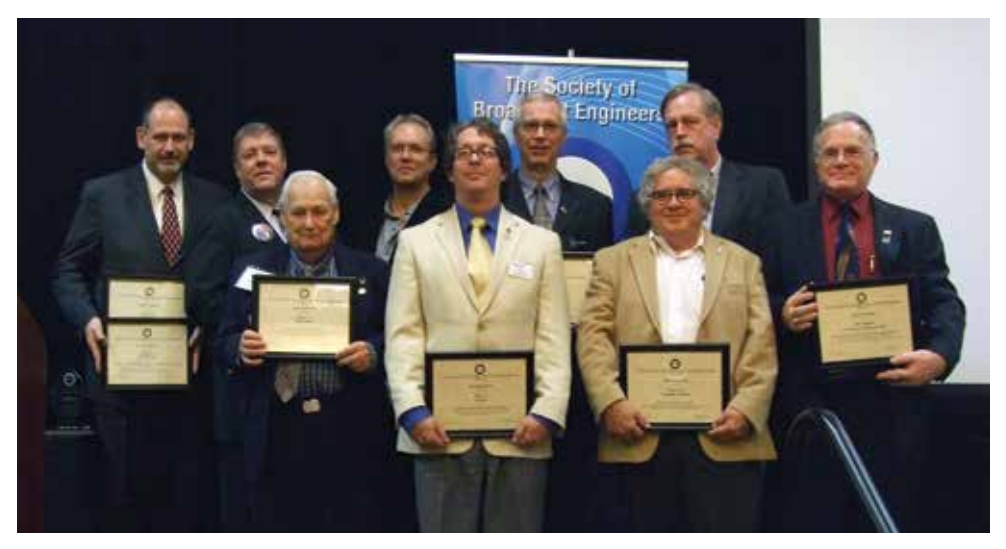
Winners of the SBE Chapter Awards gather for a group photo.