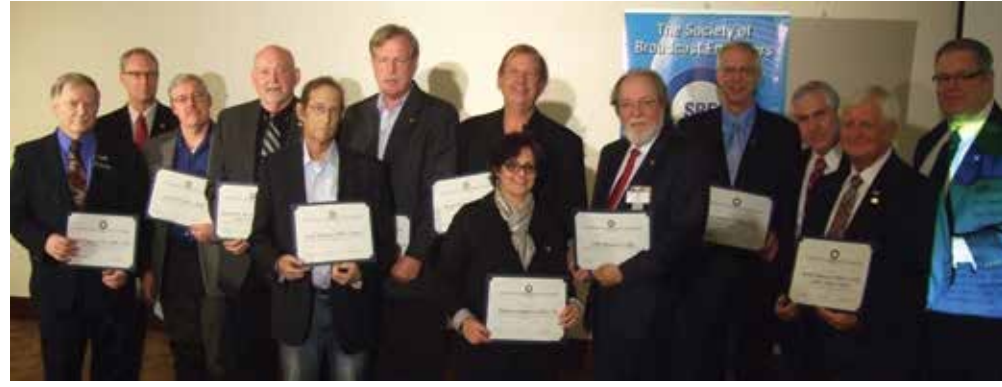
Members of the 2013 SBE National Board of Directors.

The Board approved an operating budget for the society for 2014 which keeps all membership dues levels the same as in 2013.