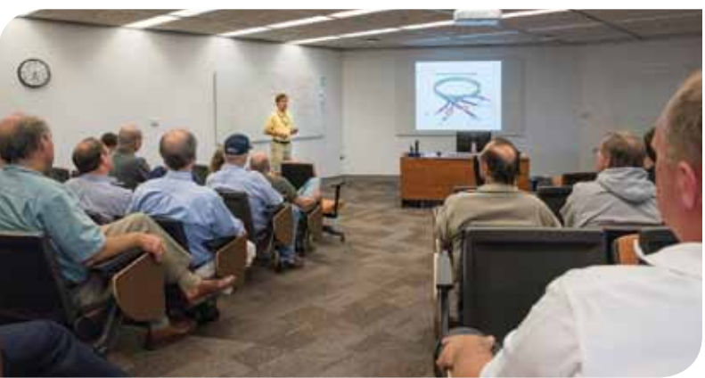
Members of Chapter 26 Chicago tour Fermi Labs.

And lastly, the most effective way for many of you to make the