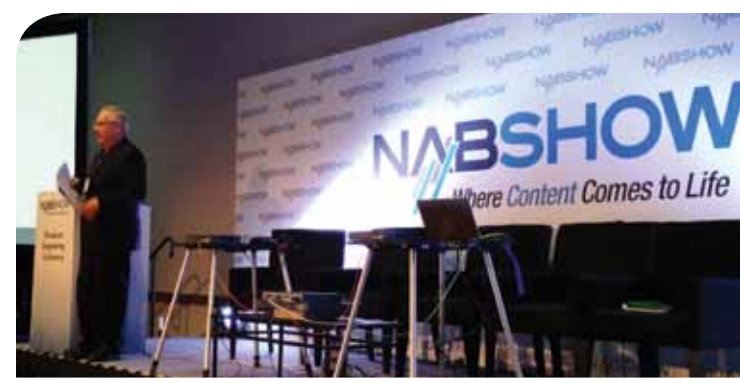
Fred Baumgartner opens the 2015 Ennes Workshop.

step forward and replaces the broadcast TV we know with a more effective and profitable platform. We are accustomed to incremental improvements in technology that are often hyped with great fanfare only to quickly fade. Still, there are broadcast technologies that profoundly changed