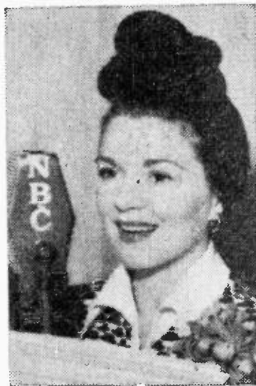
Claire Trevor, NBC dramatic actress, heard each Friday at 6 p. m. on the Don Ameche show, in those surprise ending short stories by Mark Hellinger.