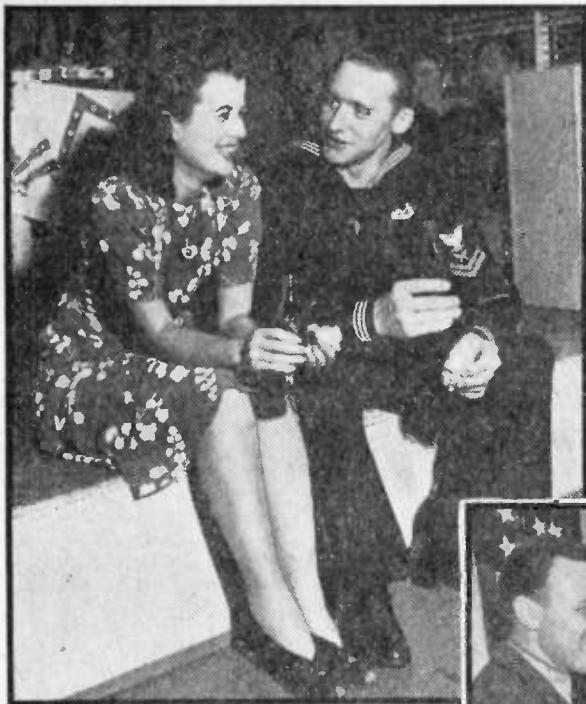
The KFAC parties for the men in the service prove ideal for the beginning of new friendships as the sailor-boy above will testify. The unidentified brunette lovely above was much in demand.