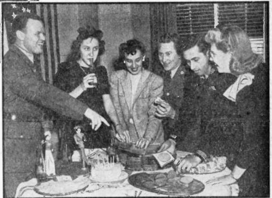
It's a gay, fun-loving atmosphere as the men in uniform gather around a buffet table heaped high with pastries and sandwiches. KFAC parties are unique in that no alcoholic beverages are served to the young people who attend.

The lady stood corrected. It wasn't long before the society girls thawed