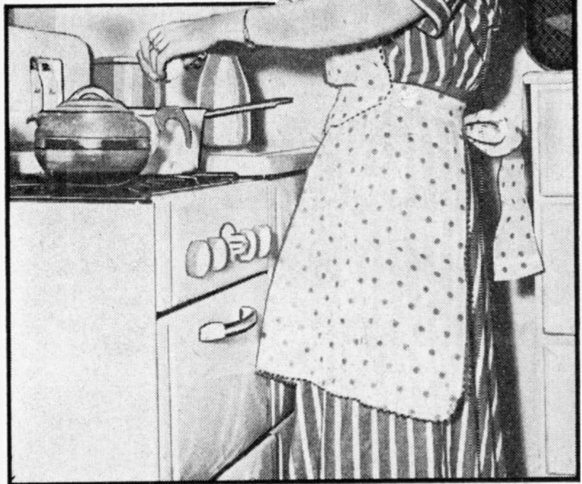
Ona Munson, feminine lead opposite Edward G. Robinson on "Big Town," KNX-CBS drama, is considered almost as handy in the kitchen as she is in front of a microphone. For the above picture she allowed the Radio Life cameraman to invade her kitchen for a rare photograph.

To hold any job, a person must improve consistently with it. This ap-